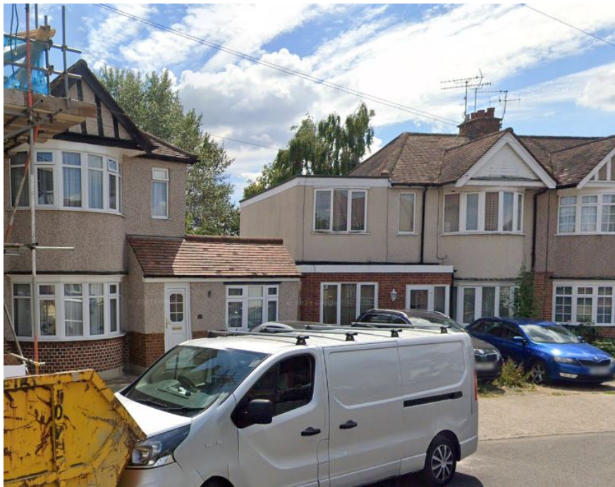
8 & 10 Seaton Gardens