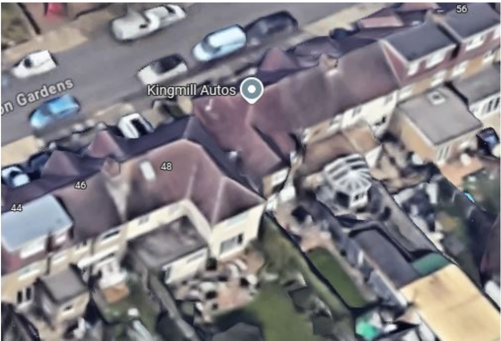
48 & 54 Seaton Gardens