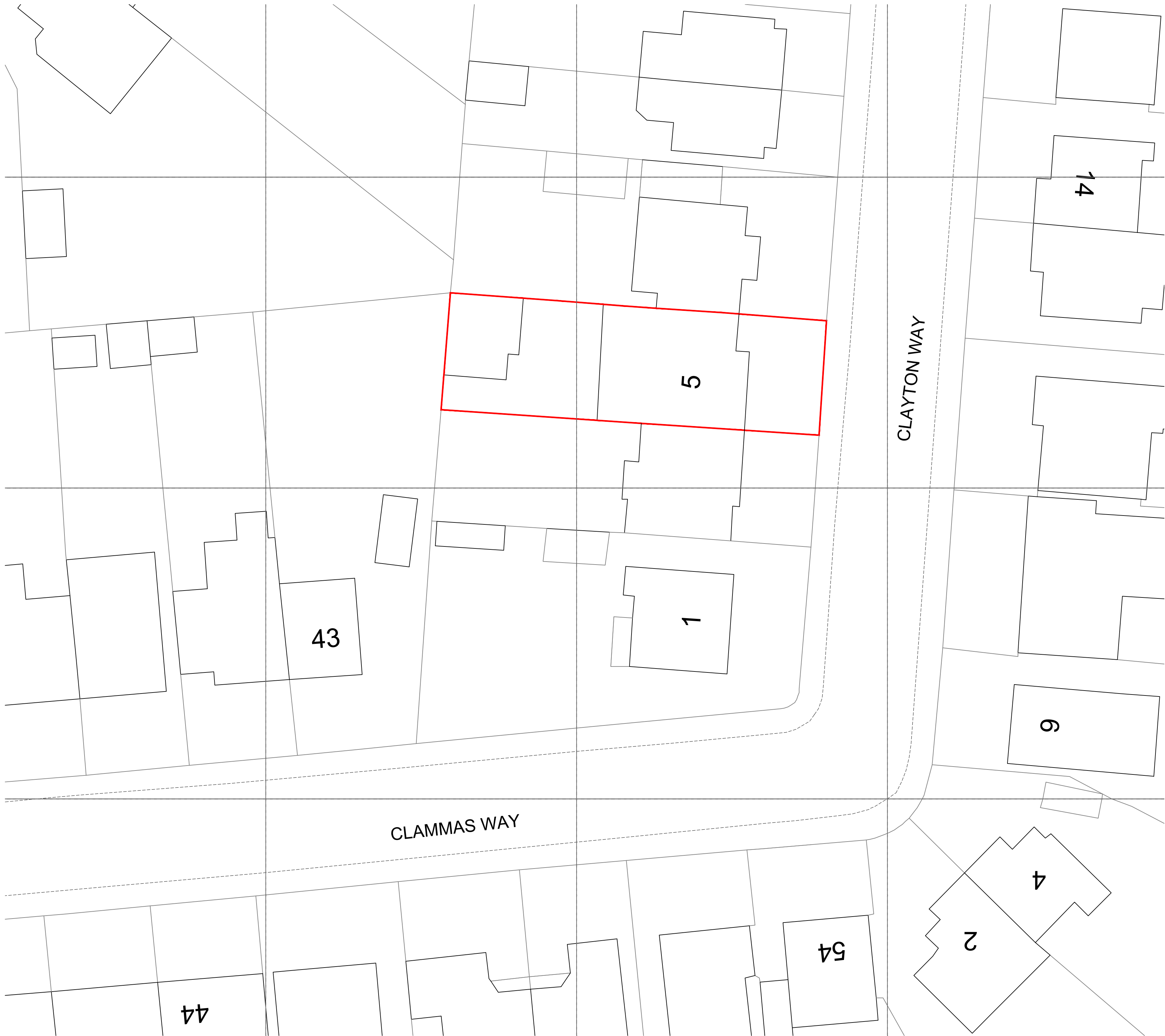
BLOCK PLAN 1:200