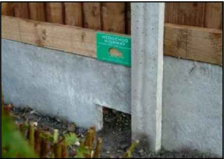
Hedgehog friendly concrete gravel board to be modified by fencing contractor