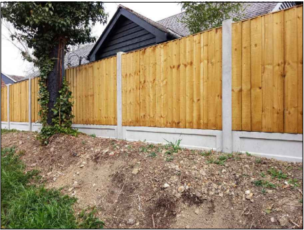
Brown Pressure feather Edge Fence Panel by Lawsons. (Front View)