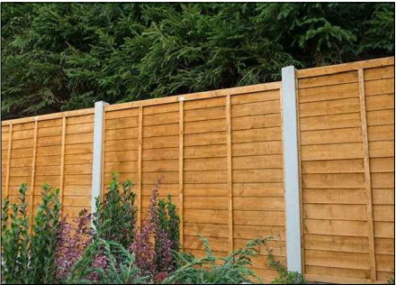
Brown Pressure feather Edge Fence Panel by Lawsons. (Back View)