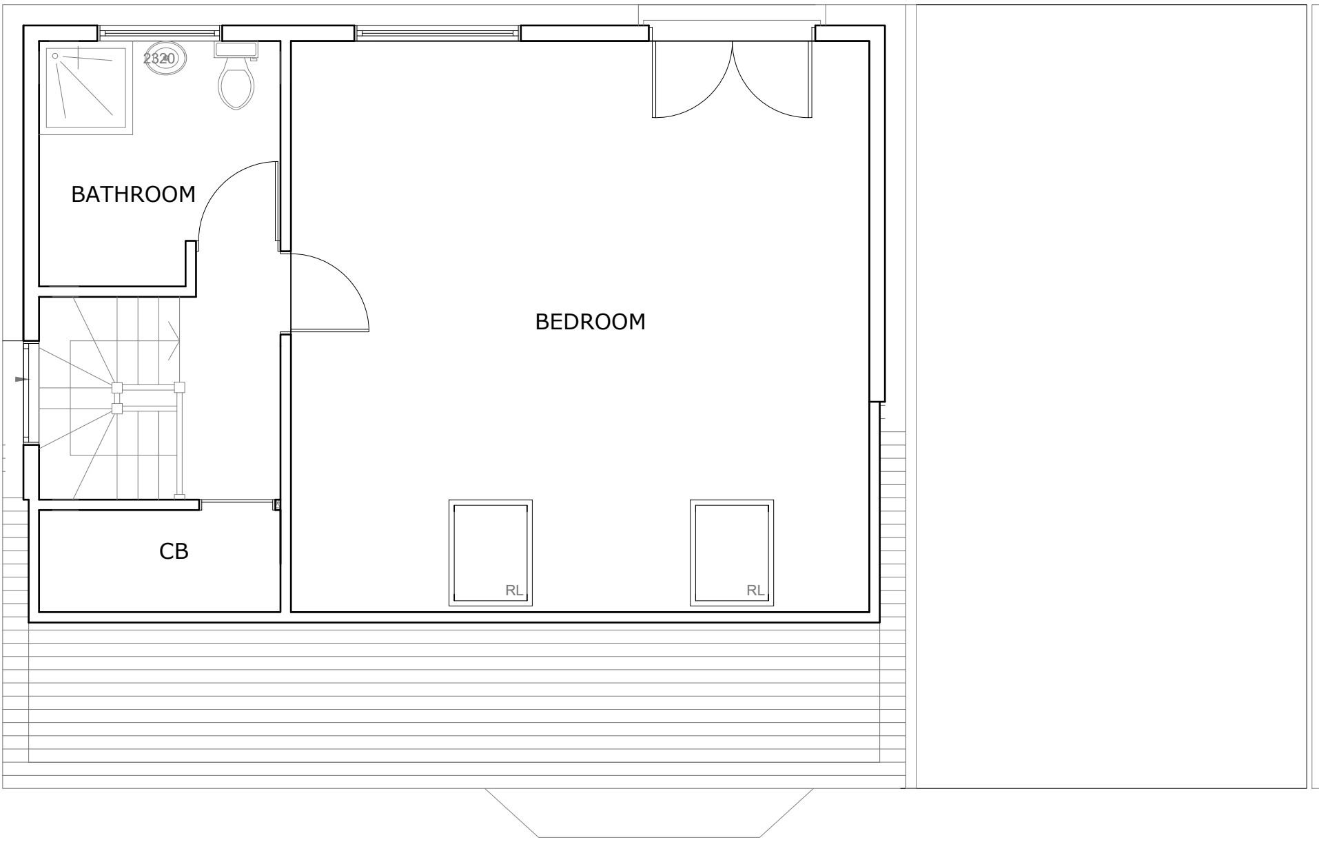
EXISTING LOFT PLAN