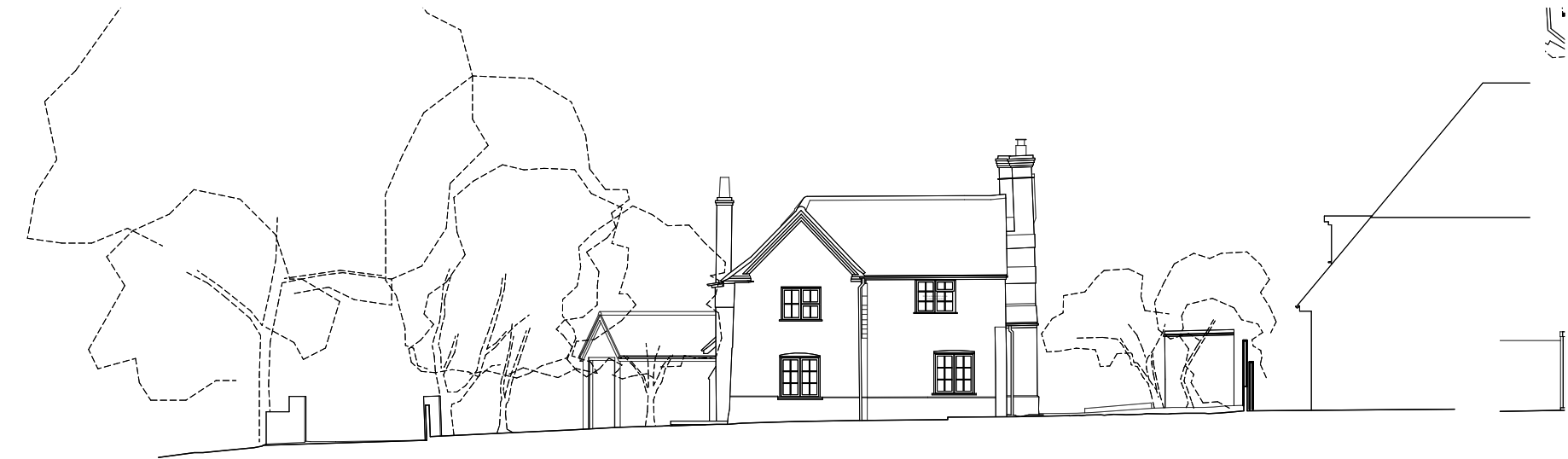
Site Section 1:200