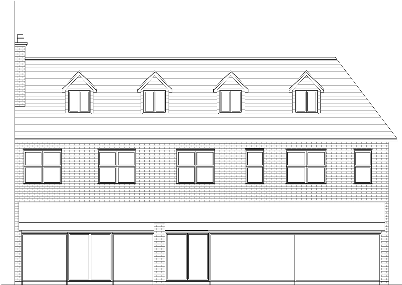
Proposed Front Elevation Scale 1:100