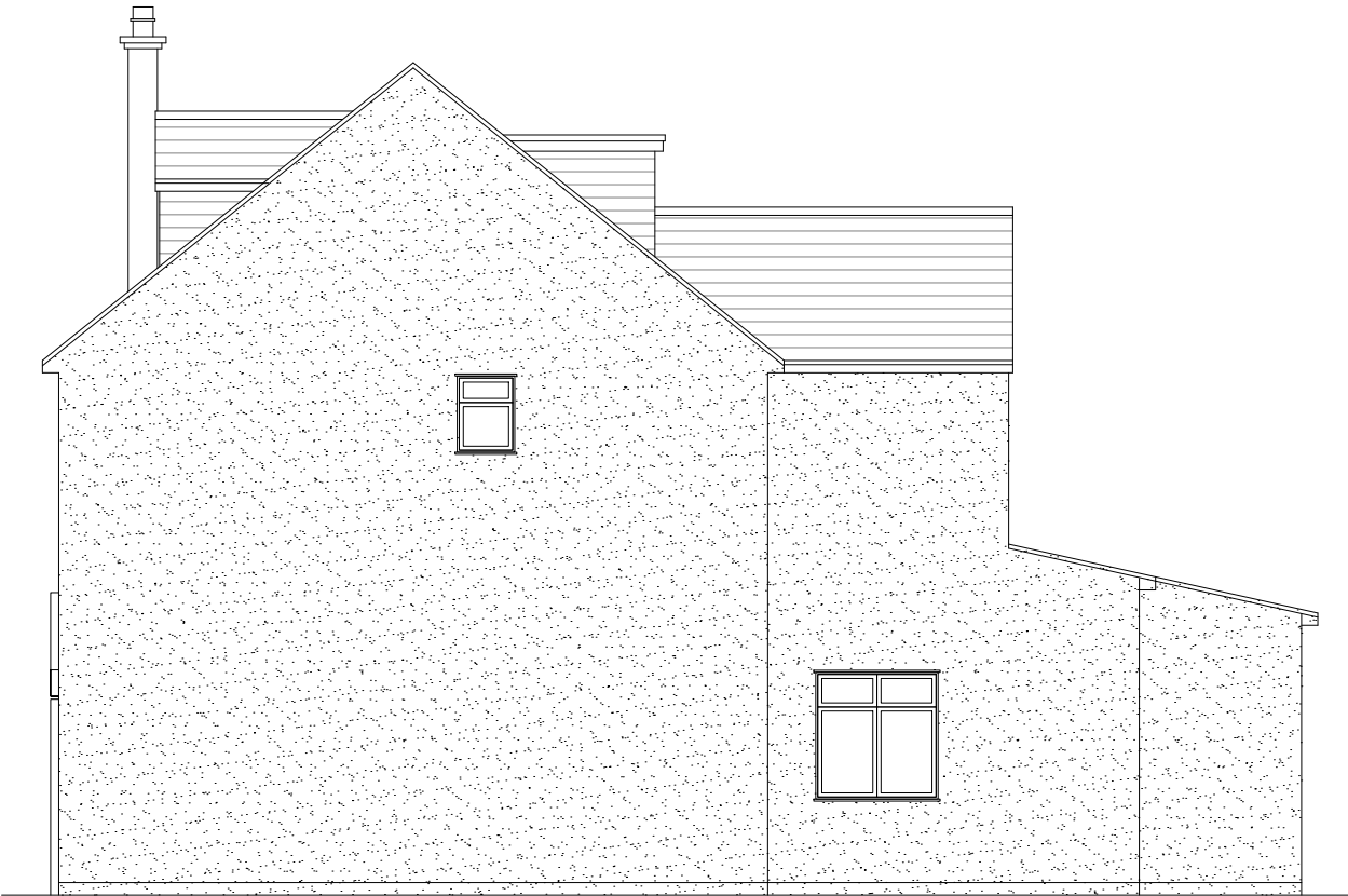
Proposed Side Elevation Scale 1:100