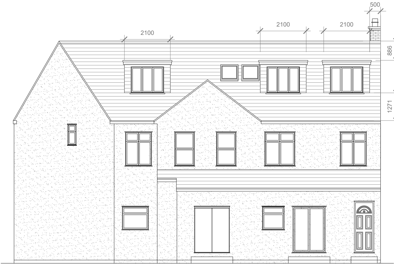
Proposed Rear Elevation Scale 1:100