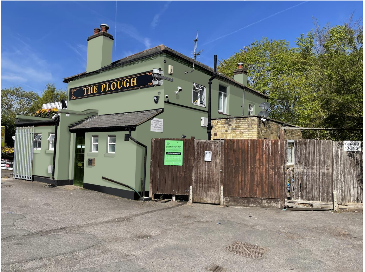
PROPOSED REAR SITE PICTURE (parking)