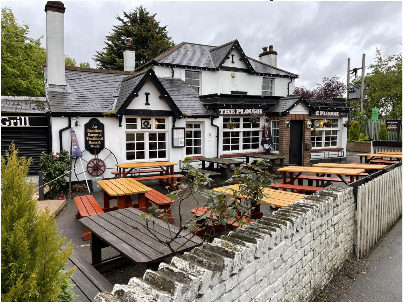
EXISTING FRONT SITE PICTURE (Sipson Road)