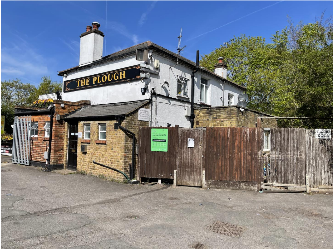
EXISTING REAR SITE PICTURE (parking)