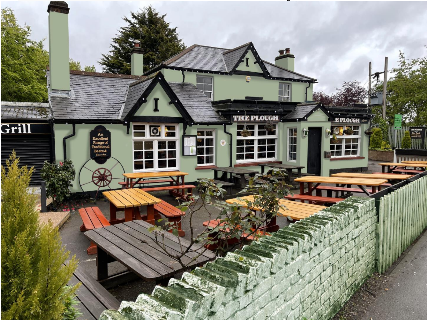
PROPOSED FRONT SITE PICTURE (Sipson Road)