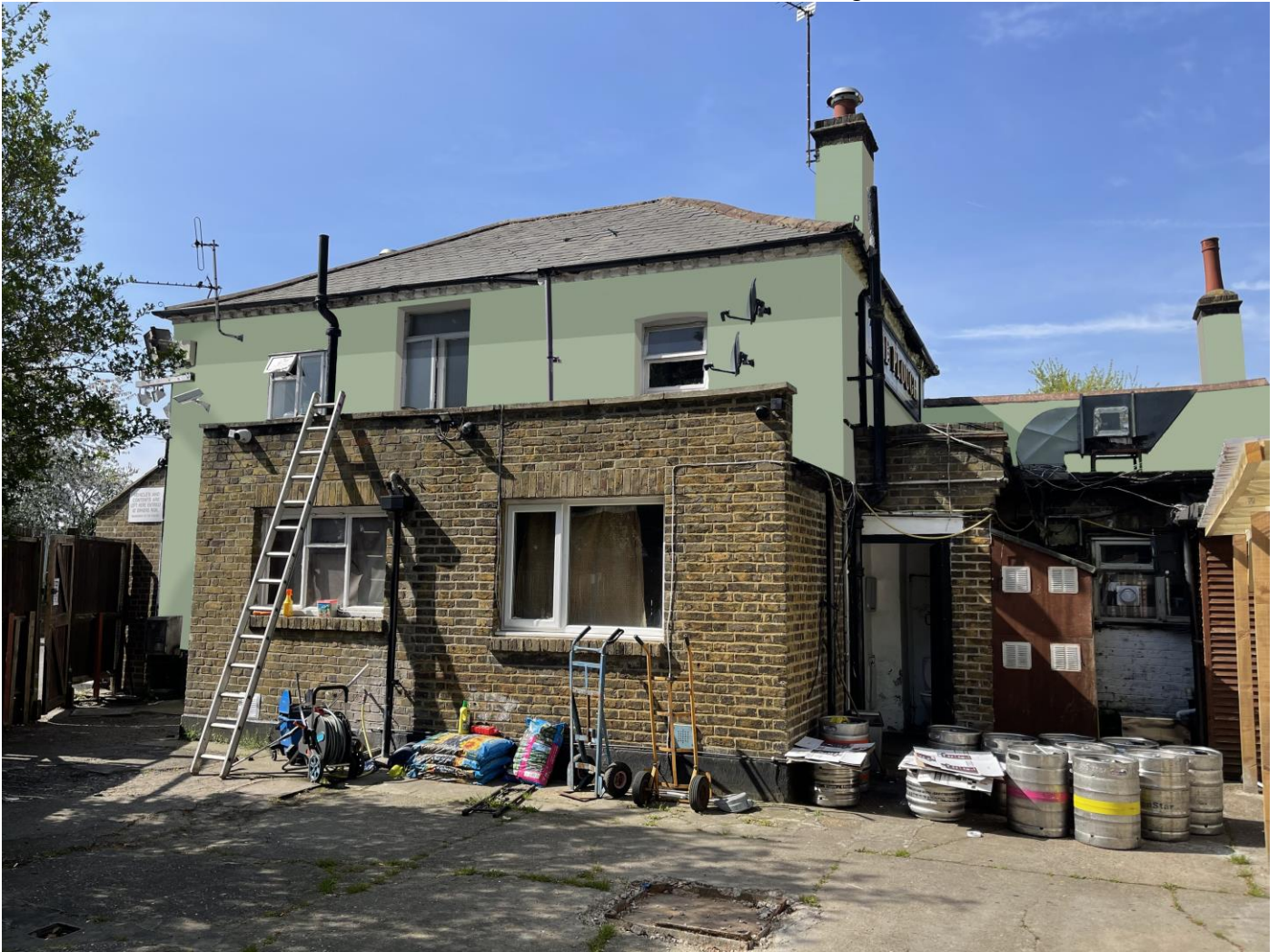
PROPOSED REAR SITE PICTURE (garden)