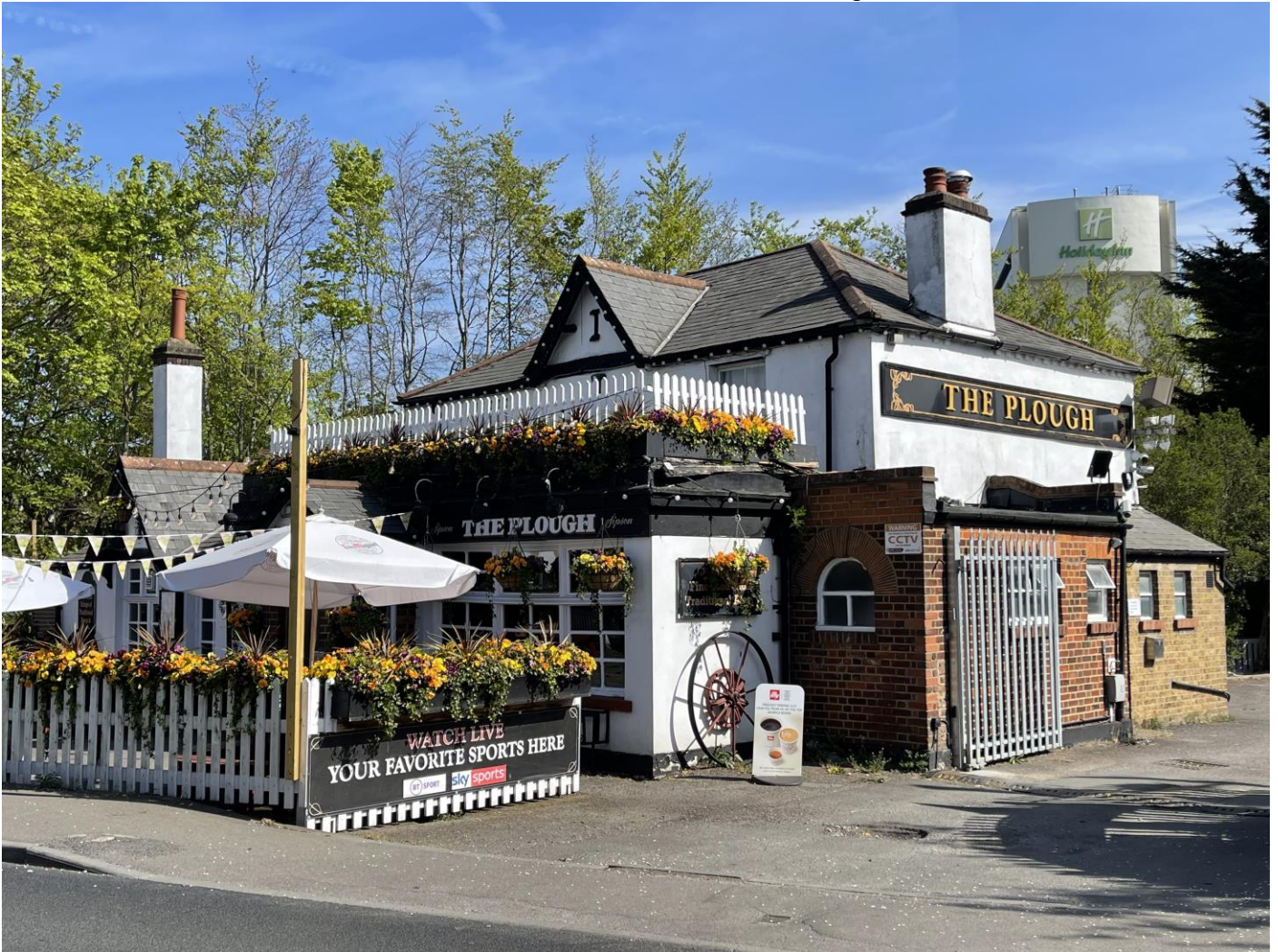
EXISTING FRONT SITE PICTURE (Sipson Road)