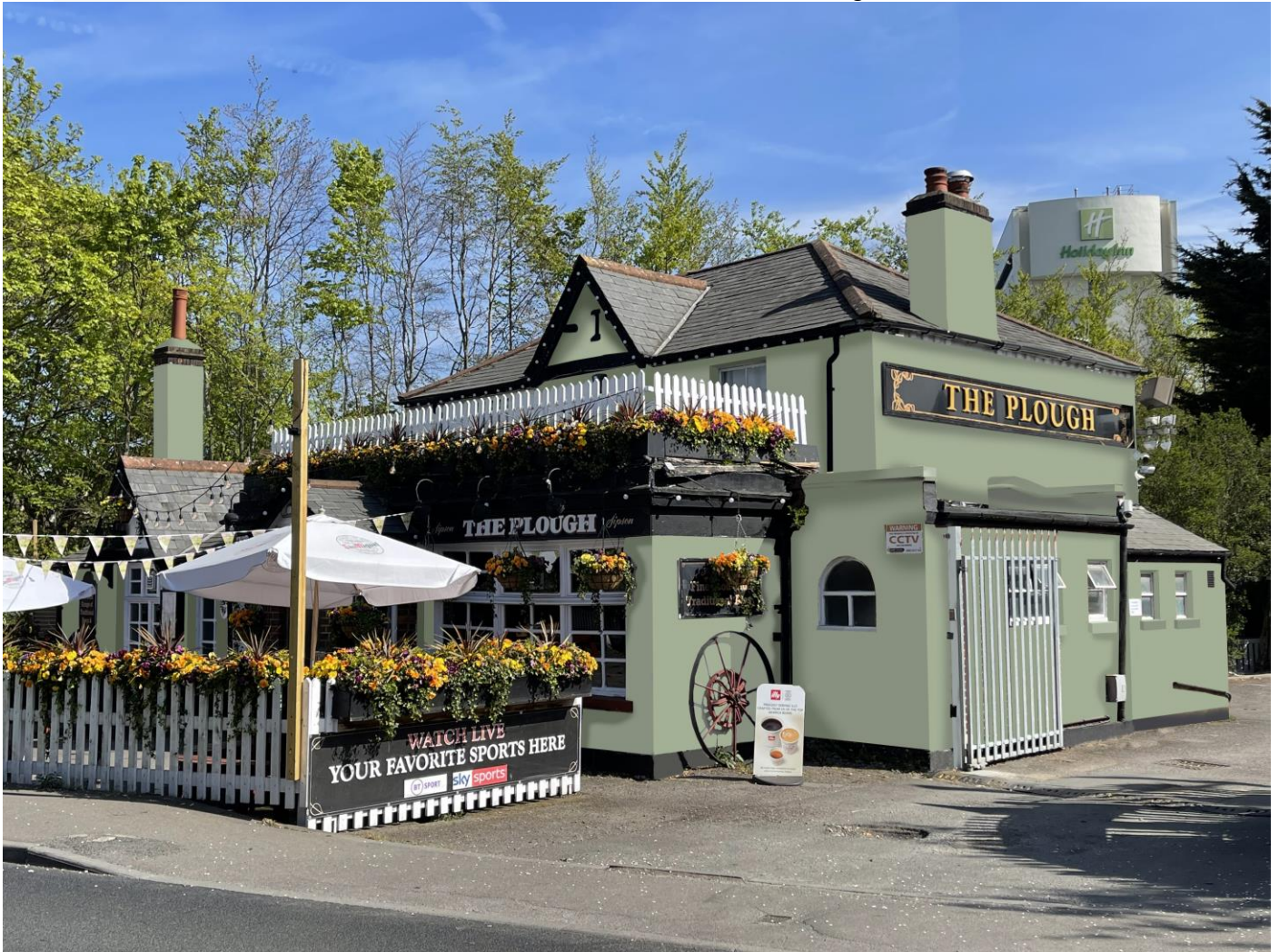
PROPOSED FRONT SITE PICTURE (Sipson Road)