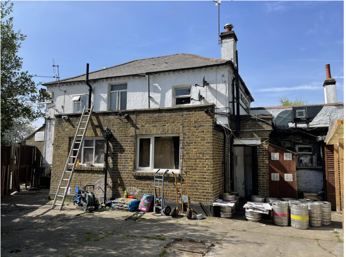
EXISTING REAR SITE PICTURE (garden)