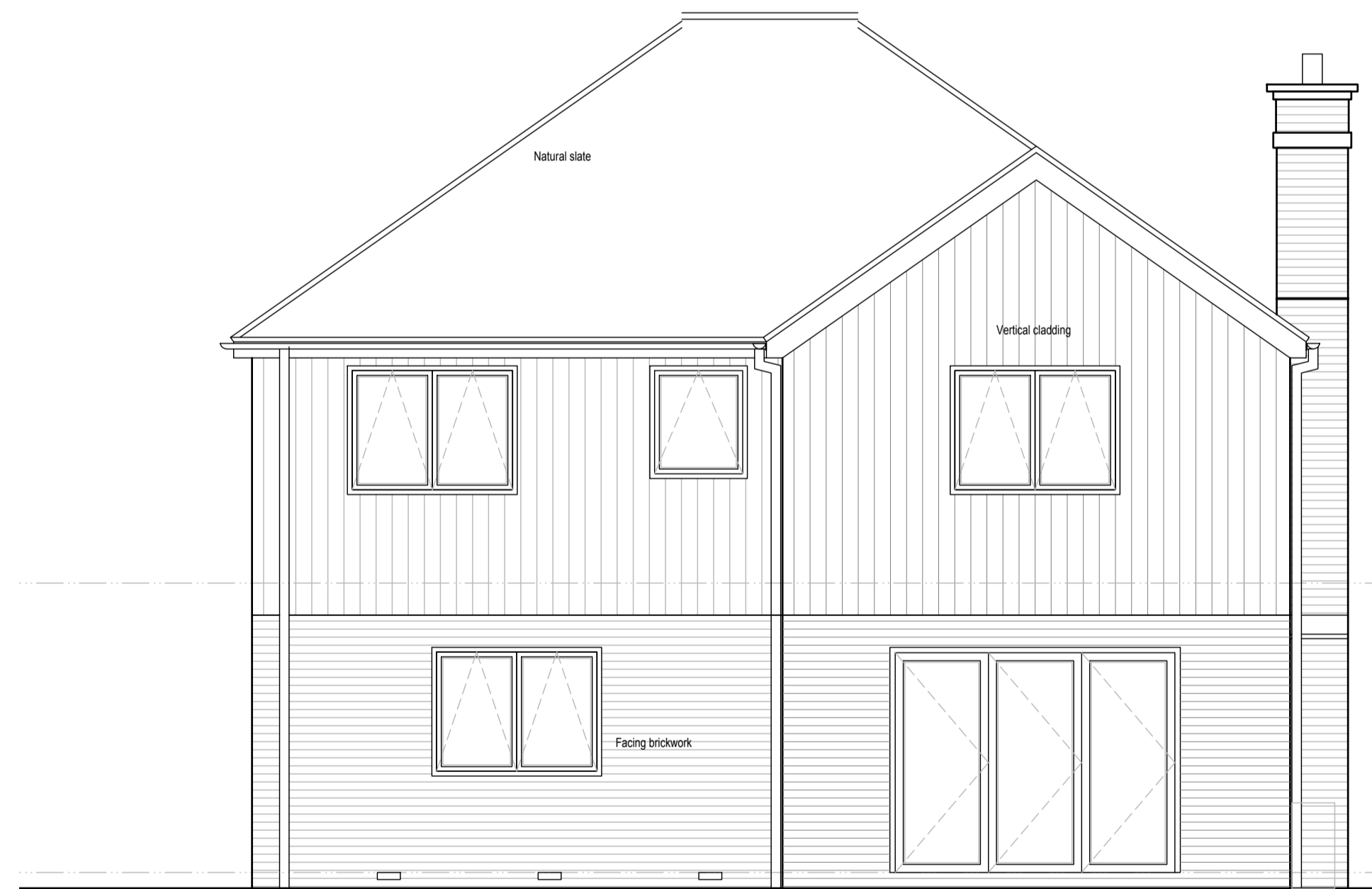
Proposed Rear Elevation Scale 1:50