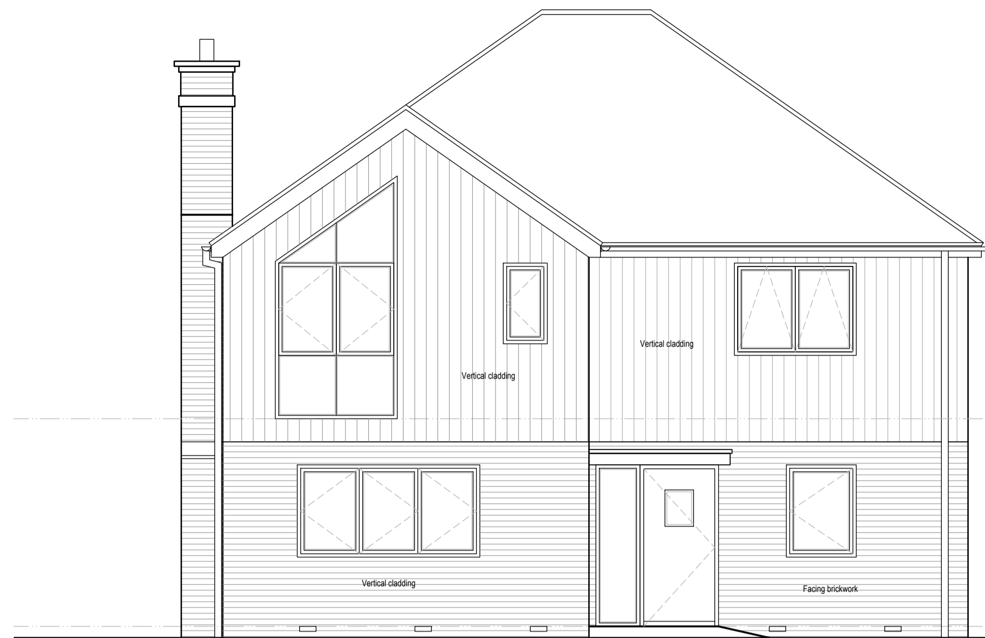
Proposed Front Elevation Scale 1:50