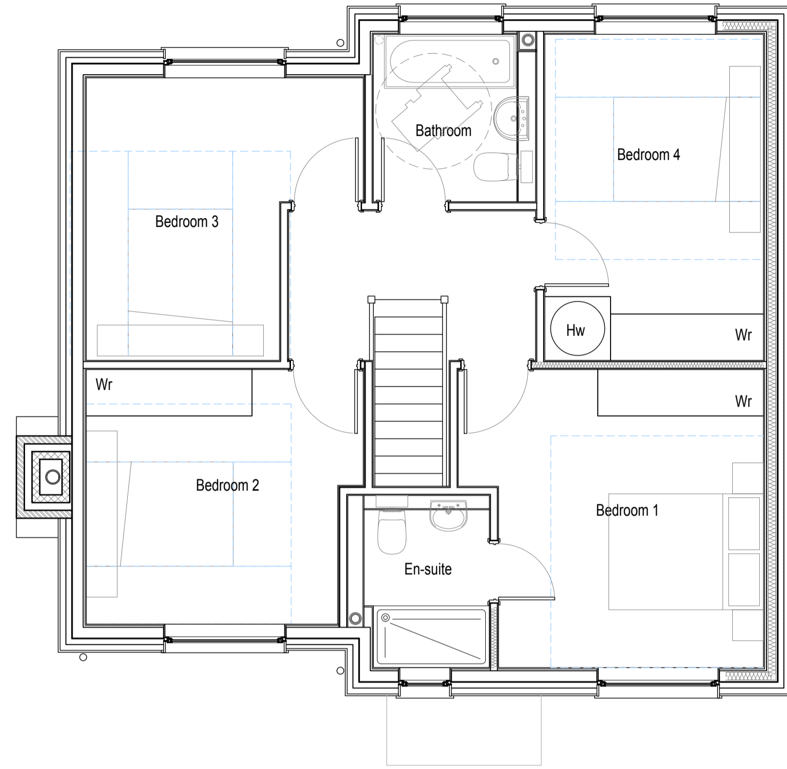
Proposed First Floor Plan Scale 1:50