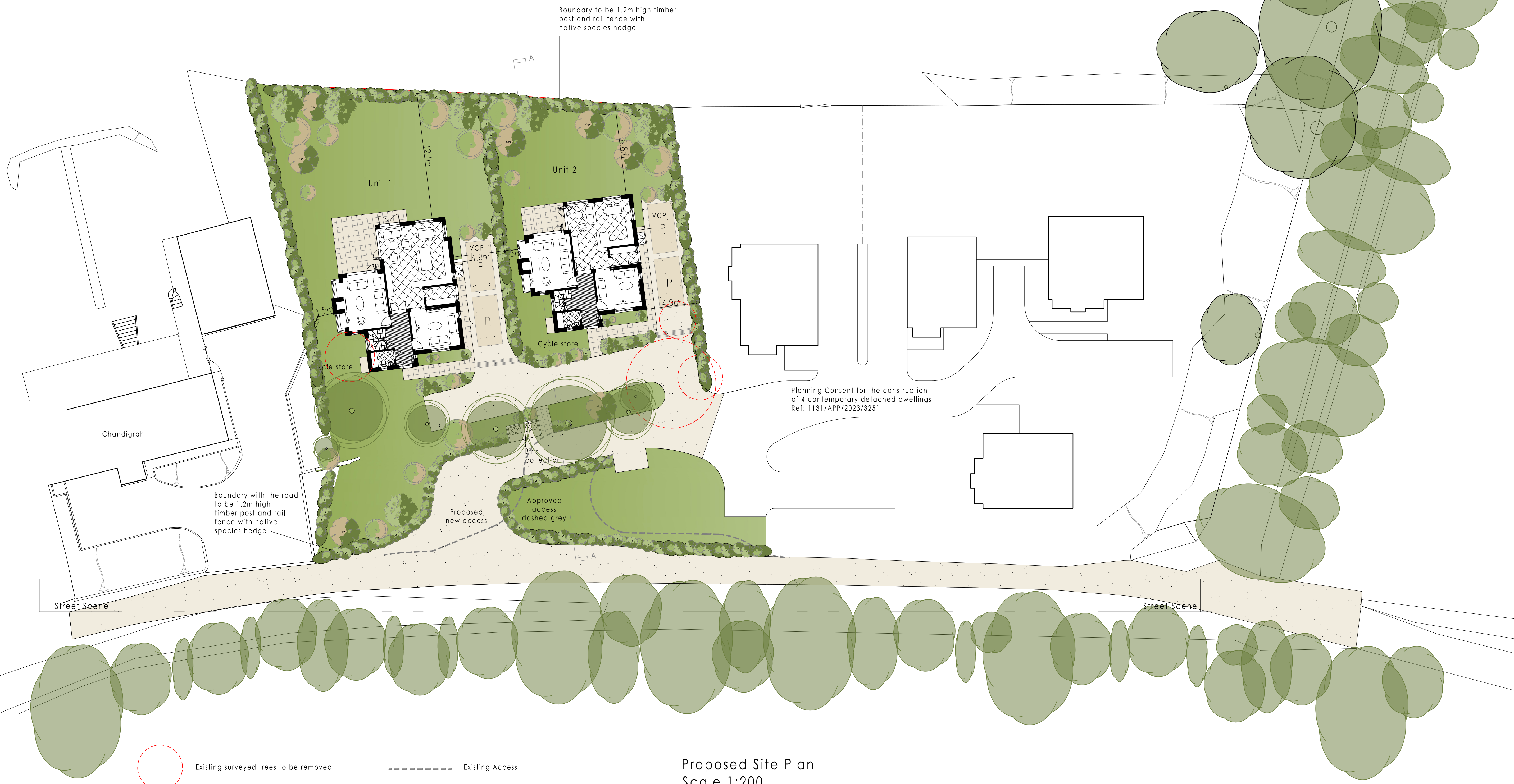
Proposed Site Plan Scale 1:200