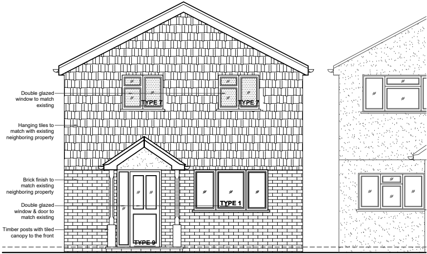
01 - FRONT ELEVATION