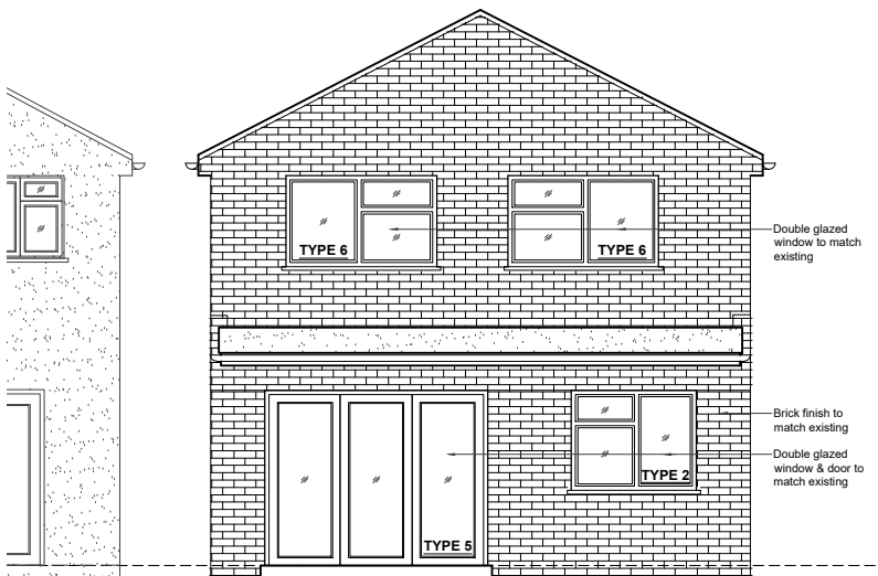
03 - REAR ELEVATION