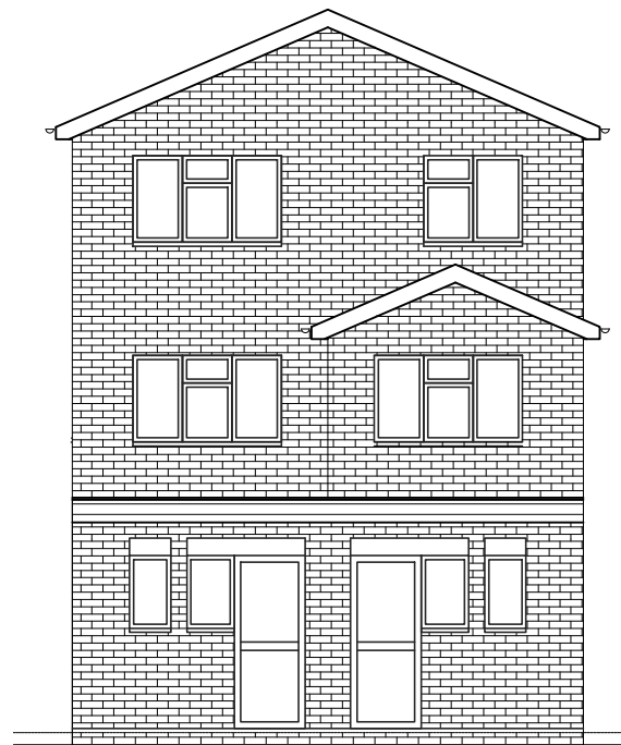
03- REAR ELEVATION