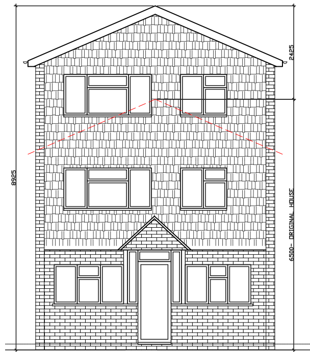
01- FRONT ELEVATION