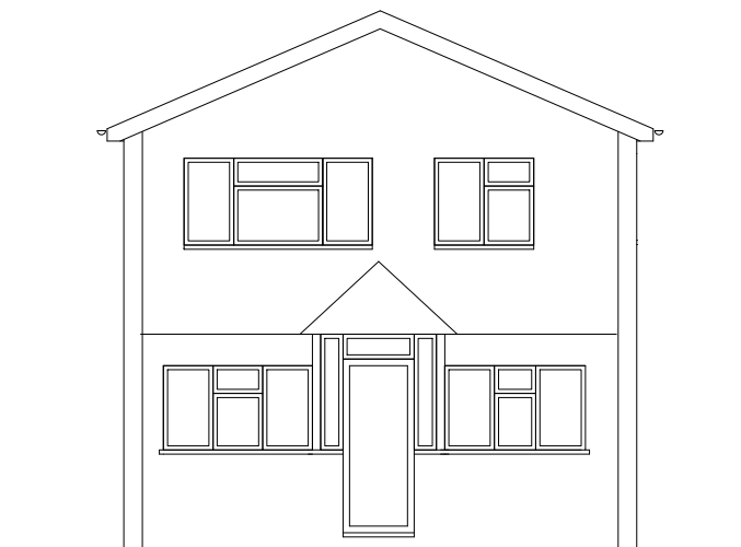
Proposed Front Elevation (No change)