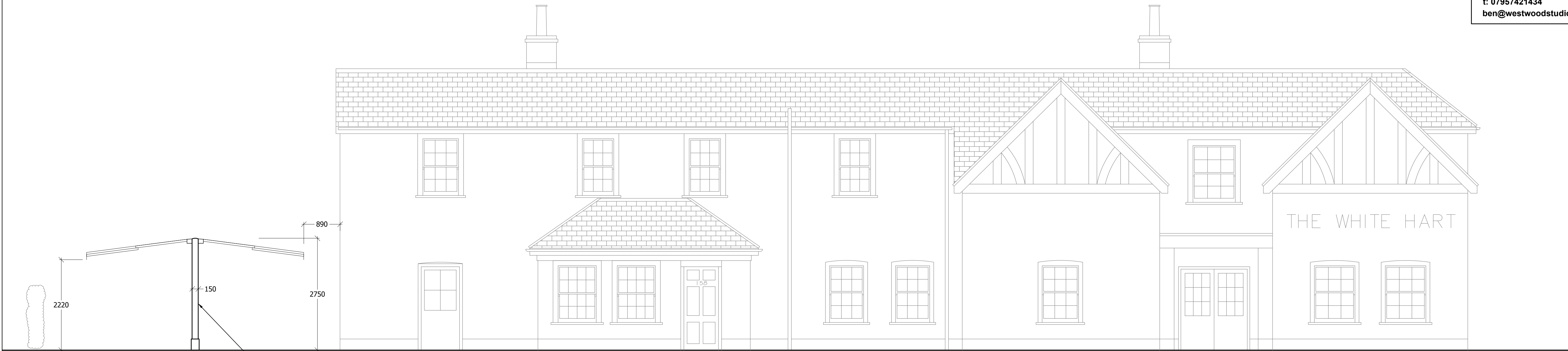
01 PROPOSED FRONT ELEVATION SCALE - 1:50 @ A1

t: 07957421434 ben@westwoodstudios.co.uk