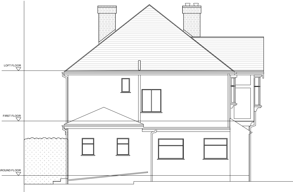
1 Existing Side Elevation scale 1:100 @ A3