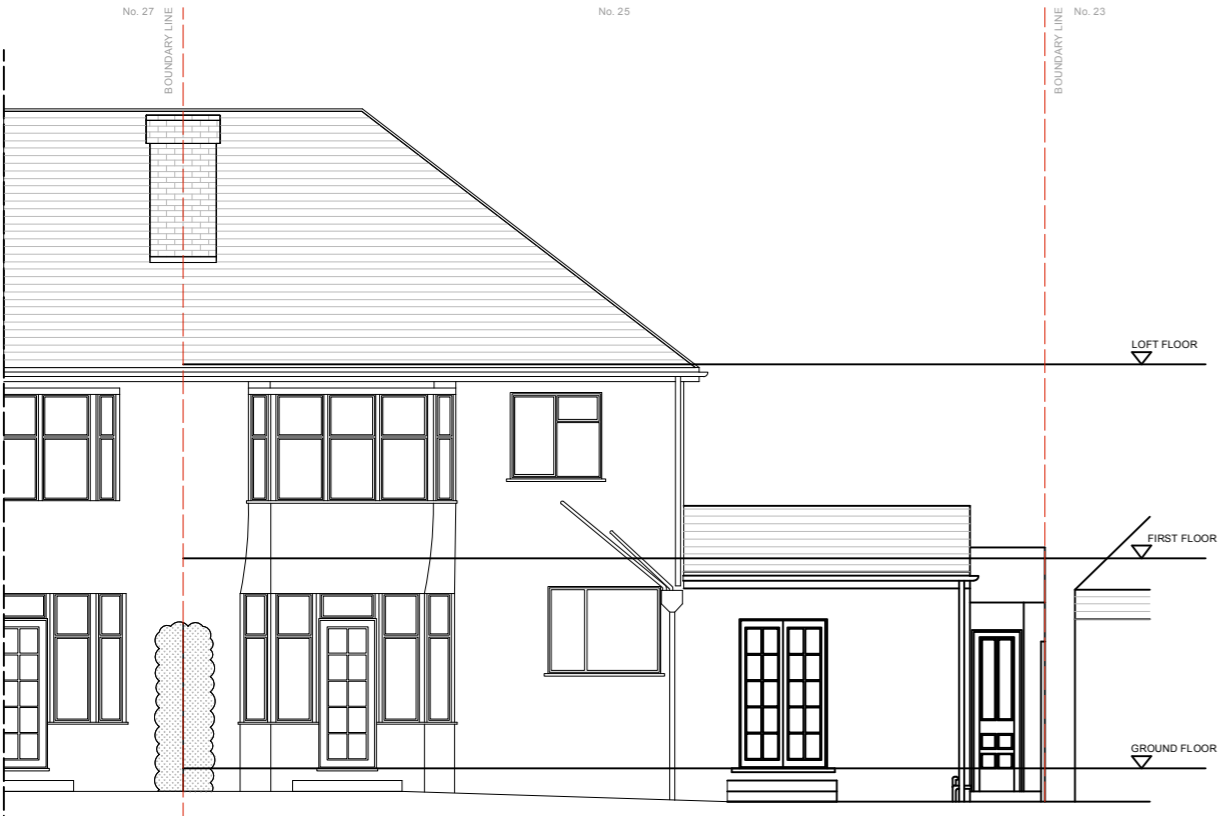
1 Existing Rear Elevation scale 1:100 @ A3