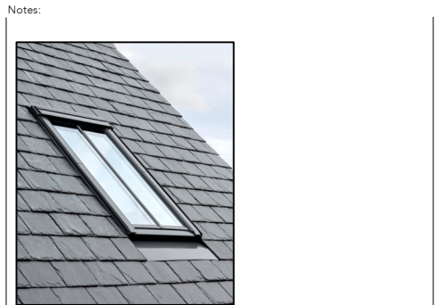
Conservation Roof Light proposed