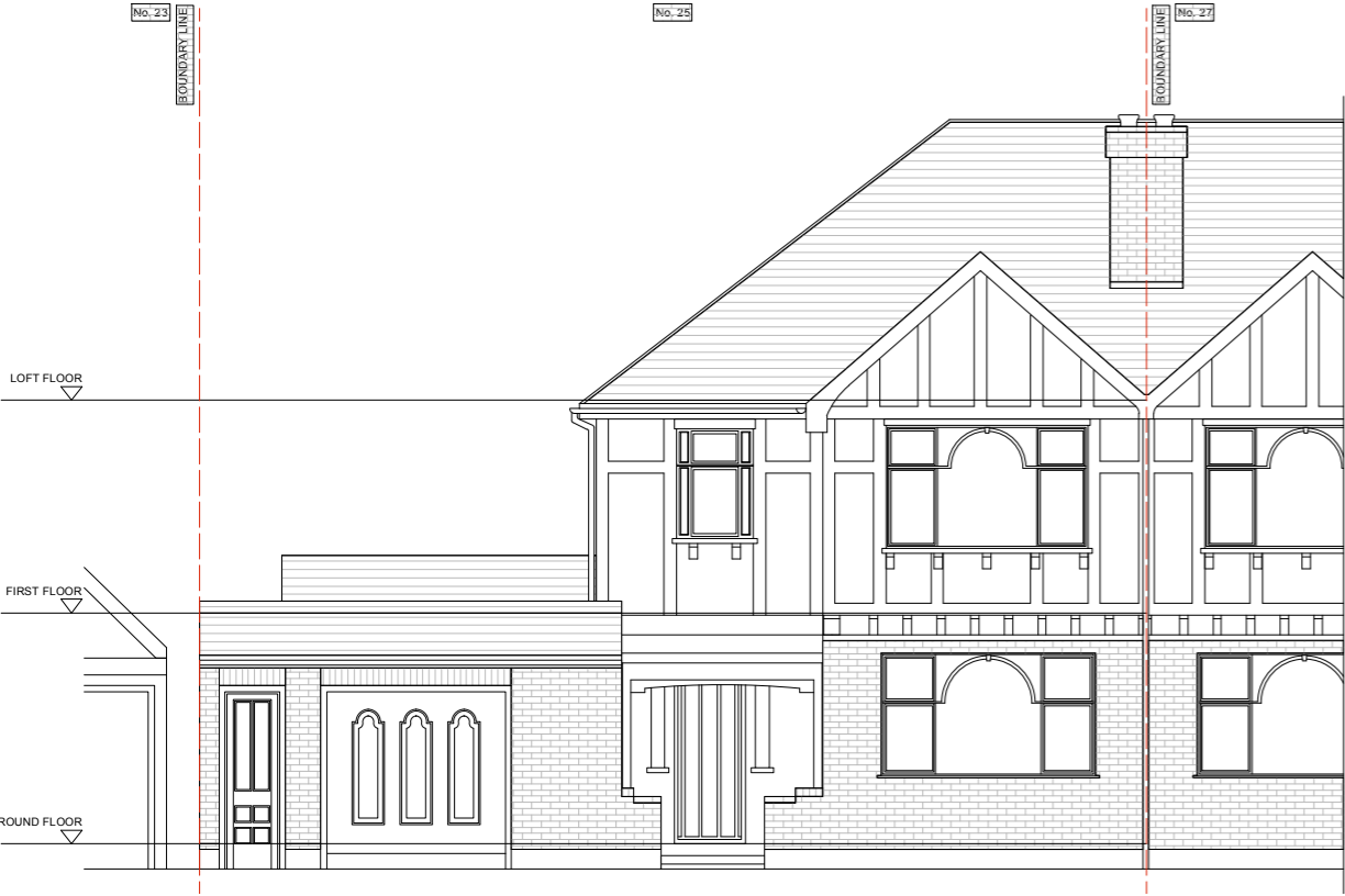
1 ExistingFront Elevation scale 1:100 @ A3