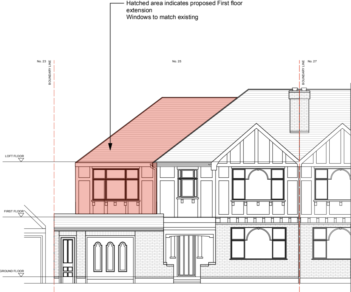
2 Proposed Front Elevation scale 1:100 @ A3