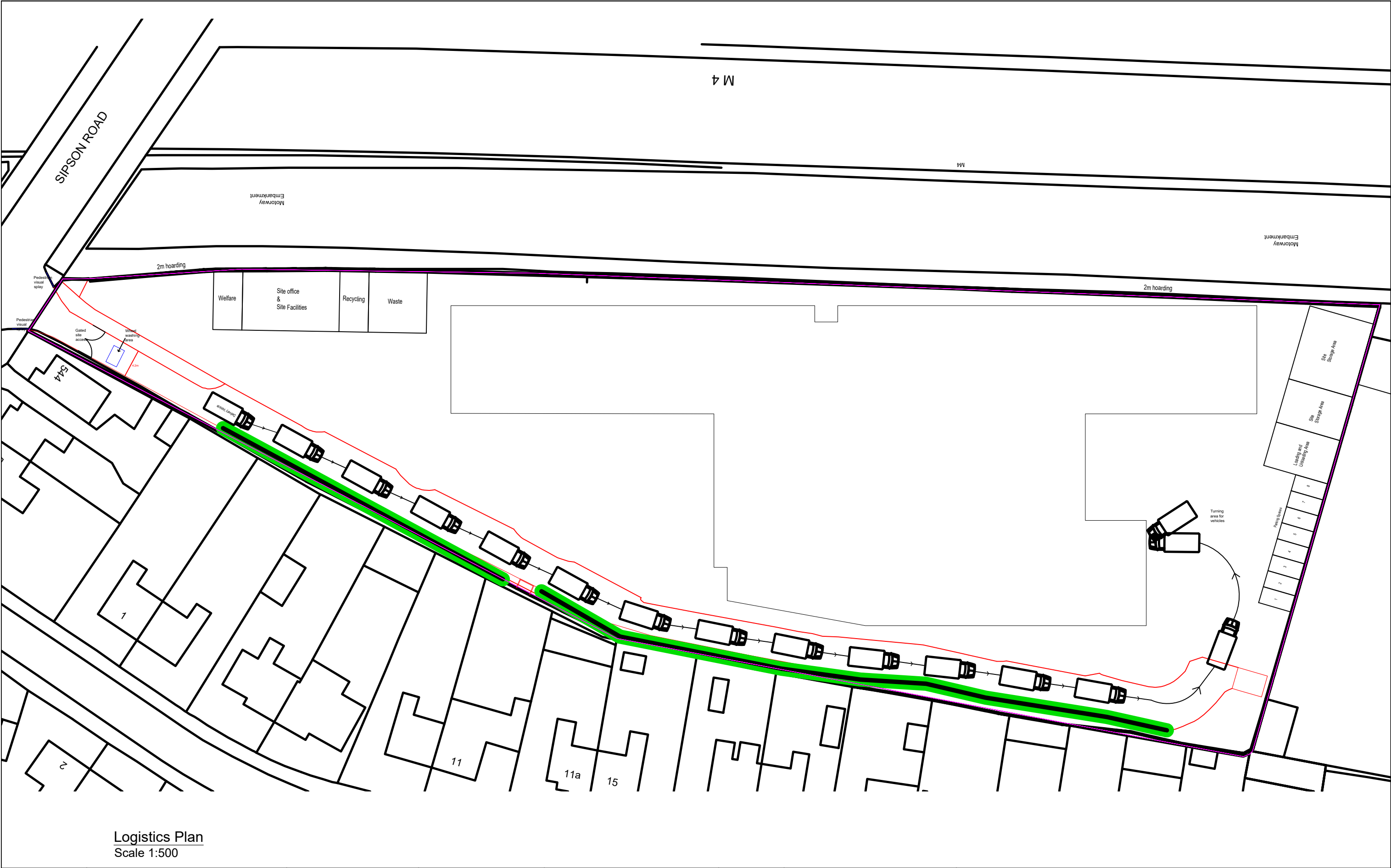
Logistics Plan Scale 1:500