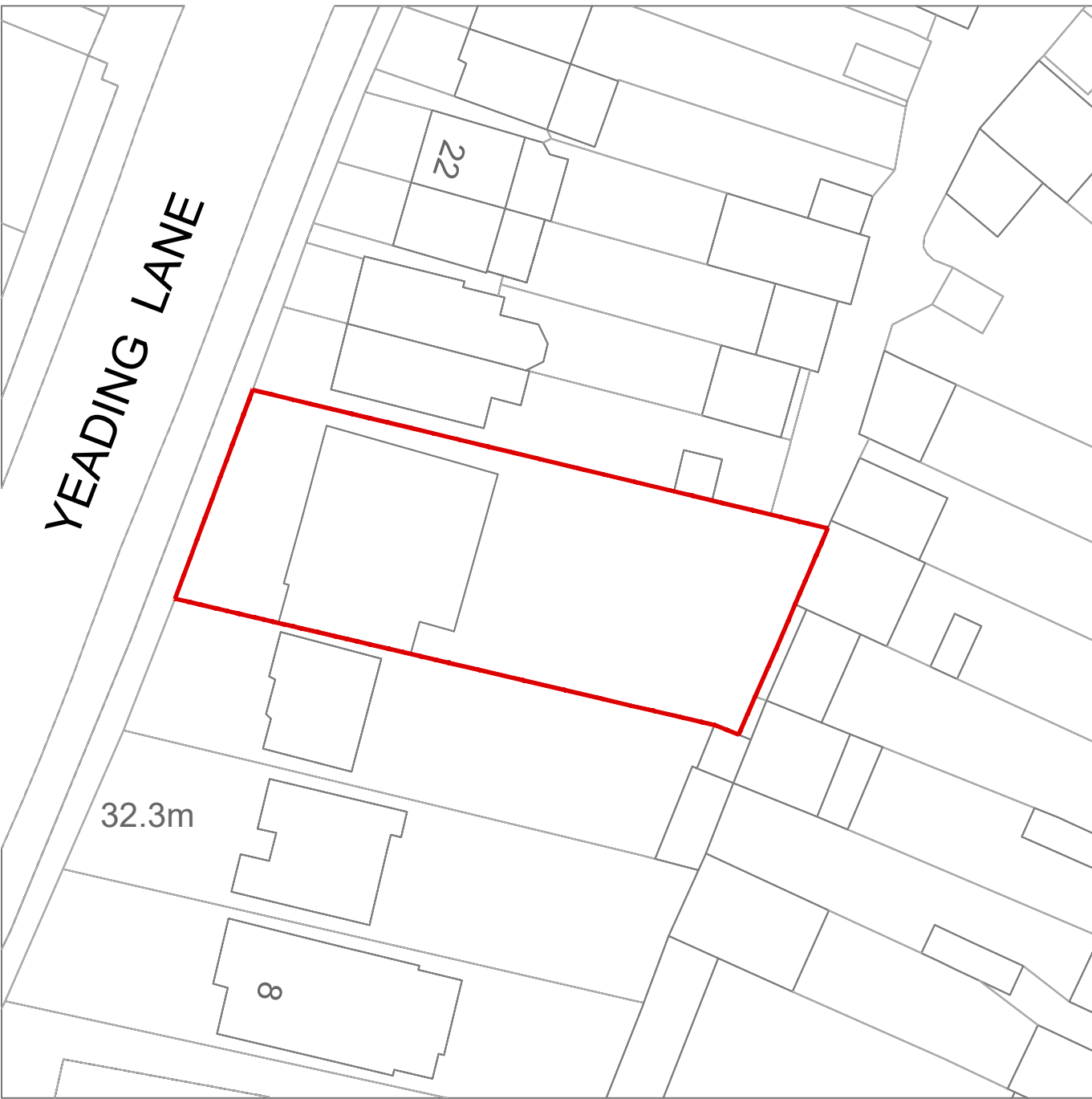
EXISTING BLOCK PLAN SCALE - 1:500