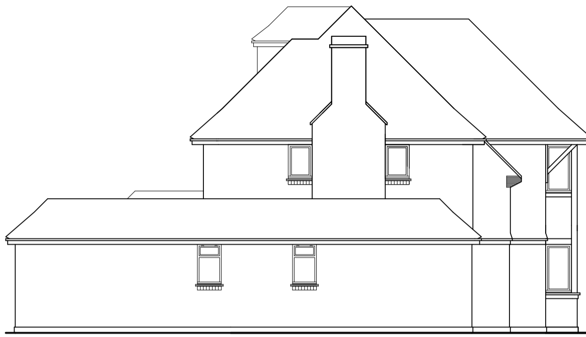
FLANK ELEVATION - 1:100