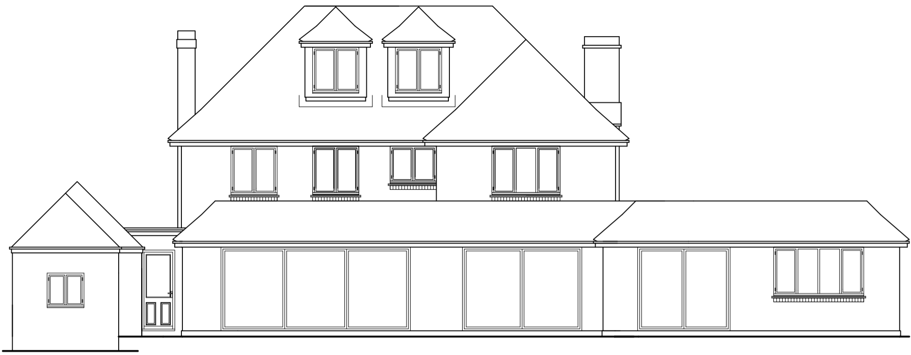
REAR ELEVATION - 1:100