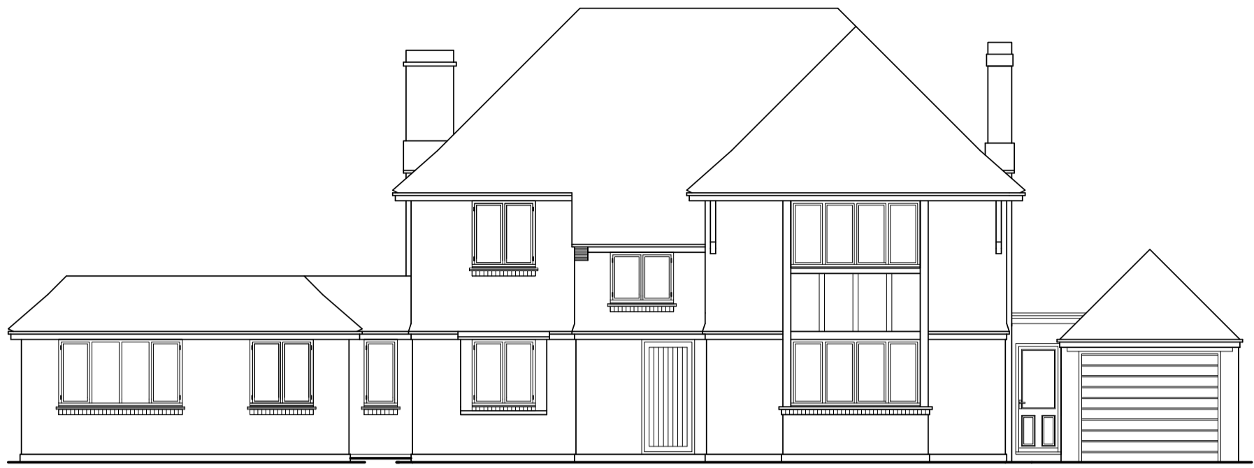
FRONT ELEVATION - 1:100