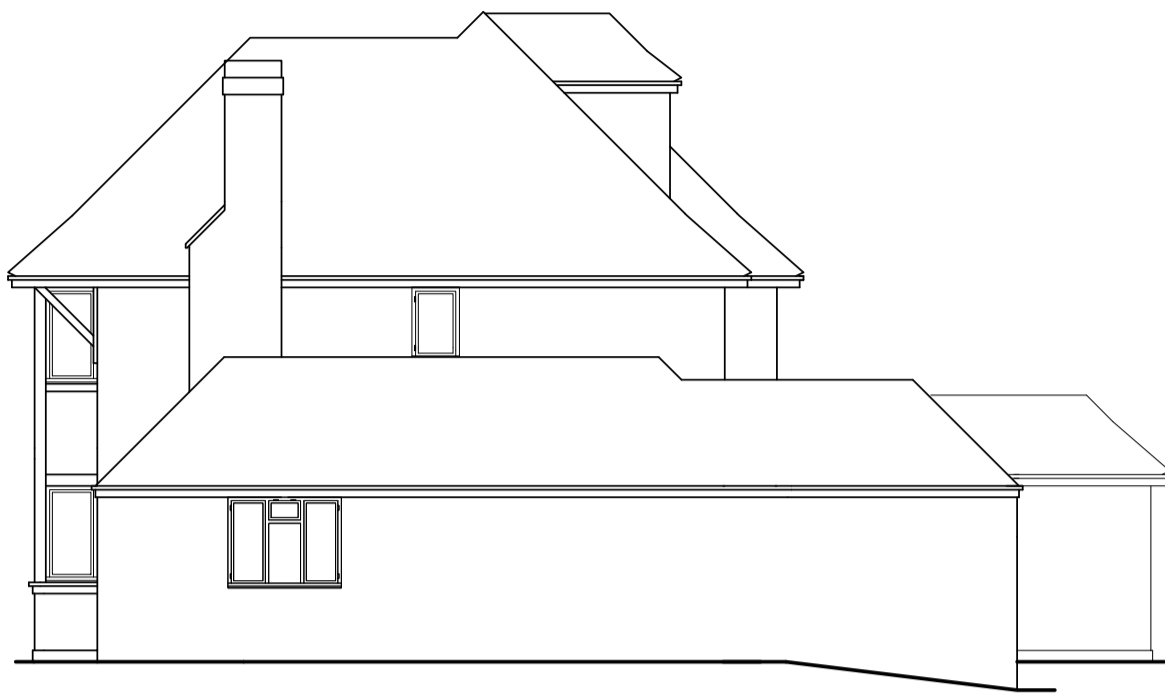
FLANK ELEVATION - 1:100