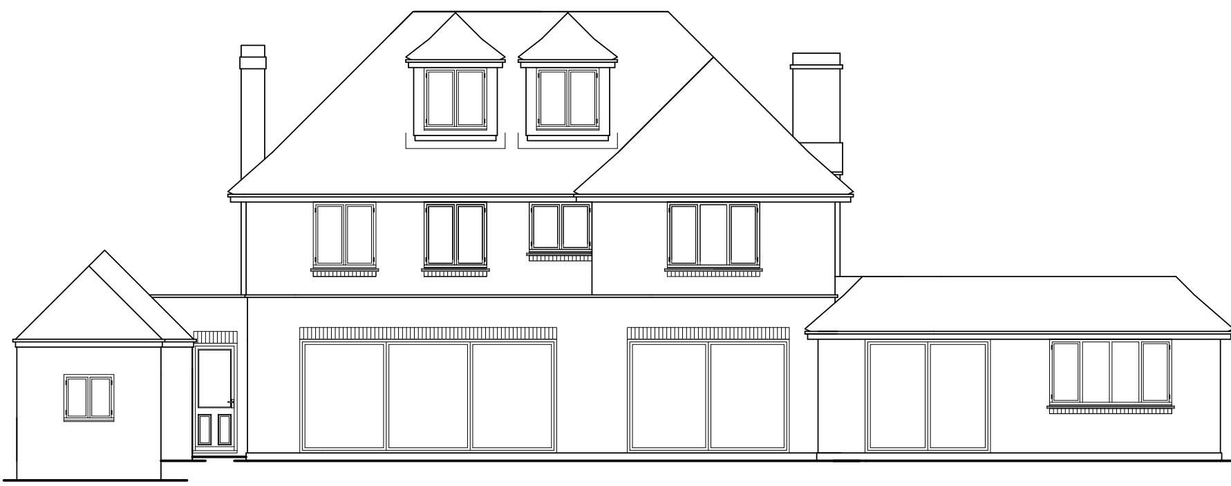
REAR ELEVATION - 1:100