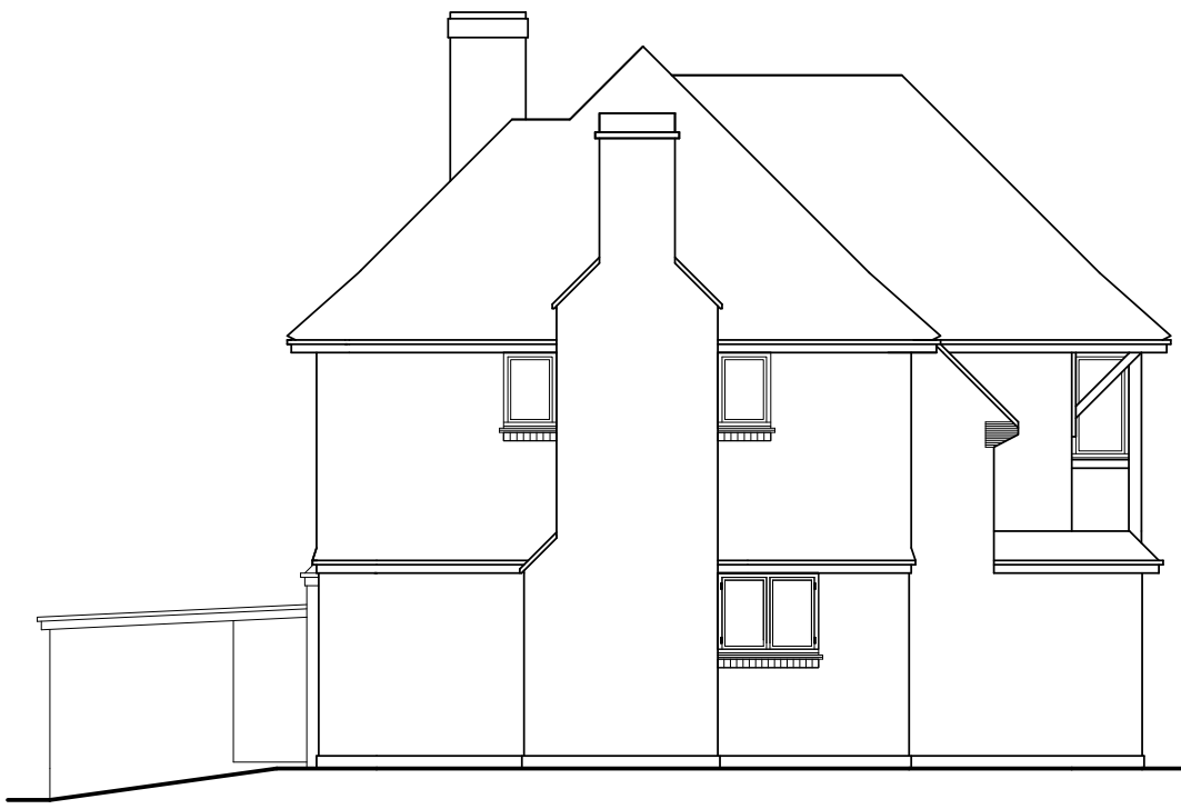
FLANK ELEVATION - 1:100