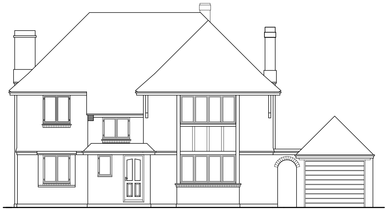
FRONT ELEVATION - 1:100