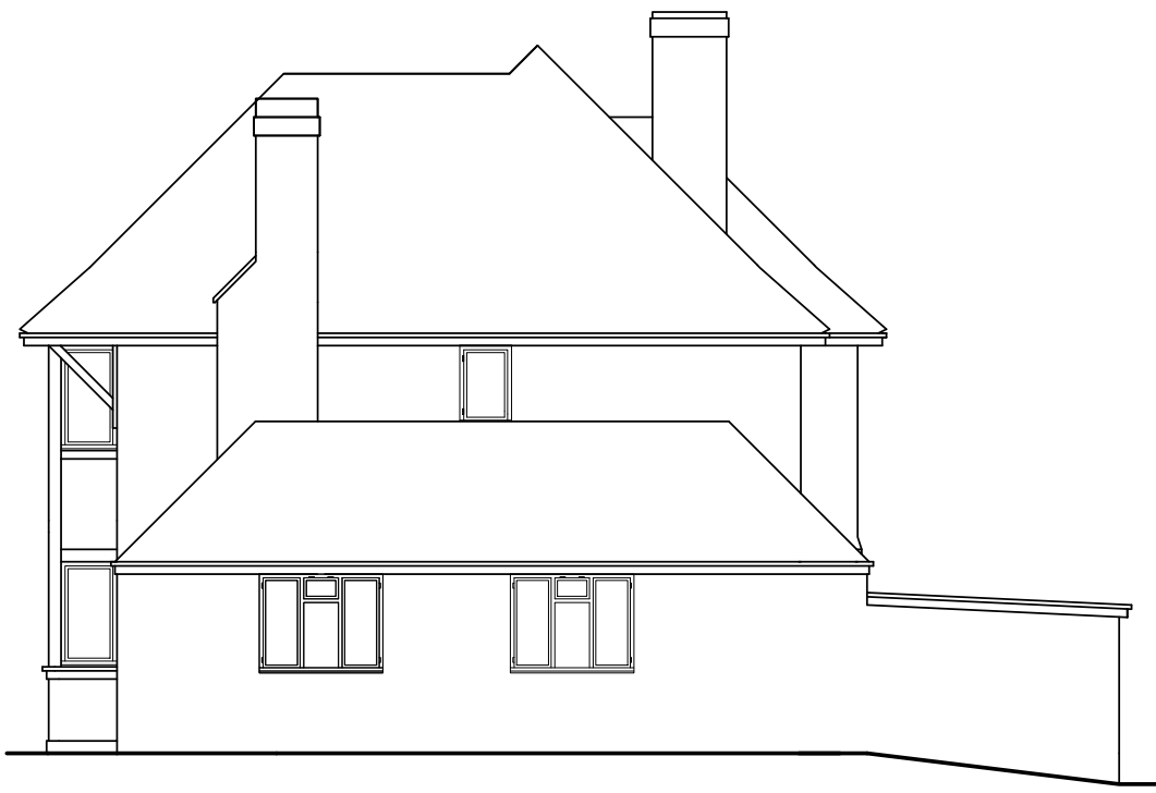
FLANK ELEVATION - 1:100