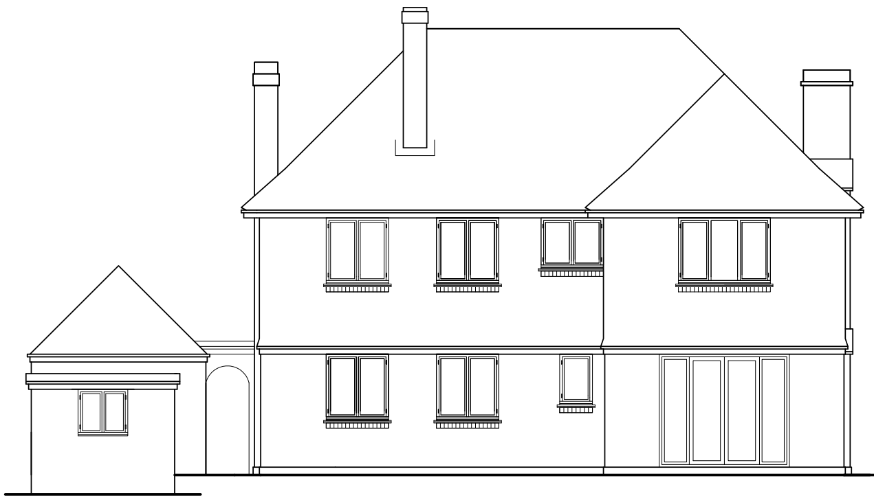
REAR ELEVATION - 1:100