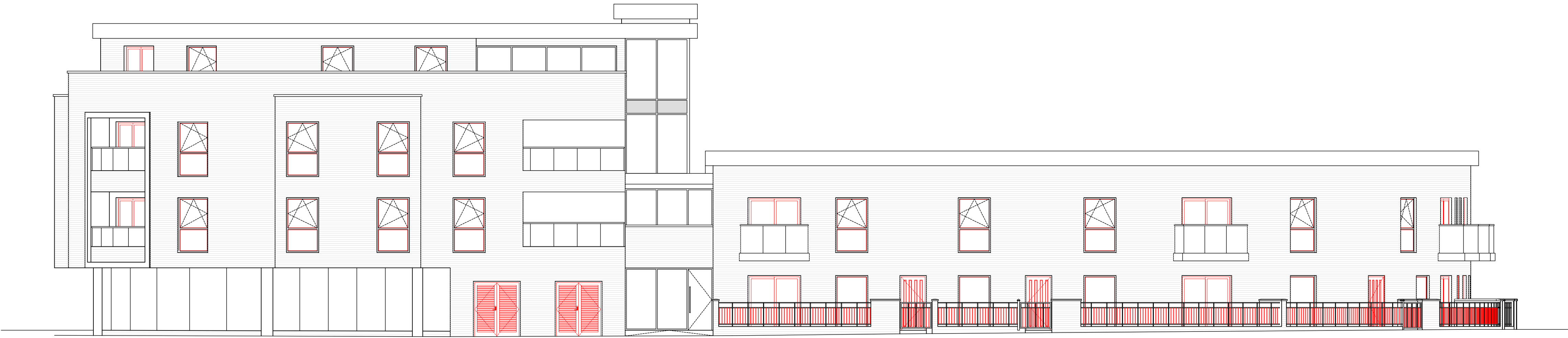
01 ELEVATION 01 SCALE 1:100 @ A1