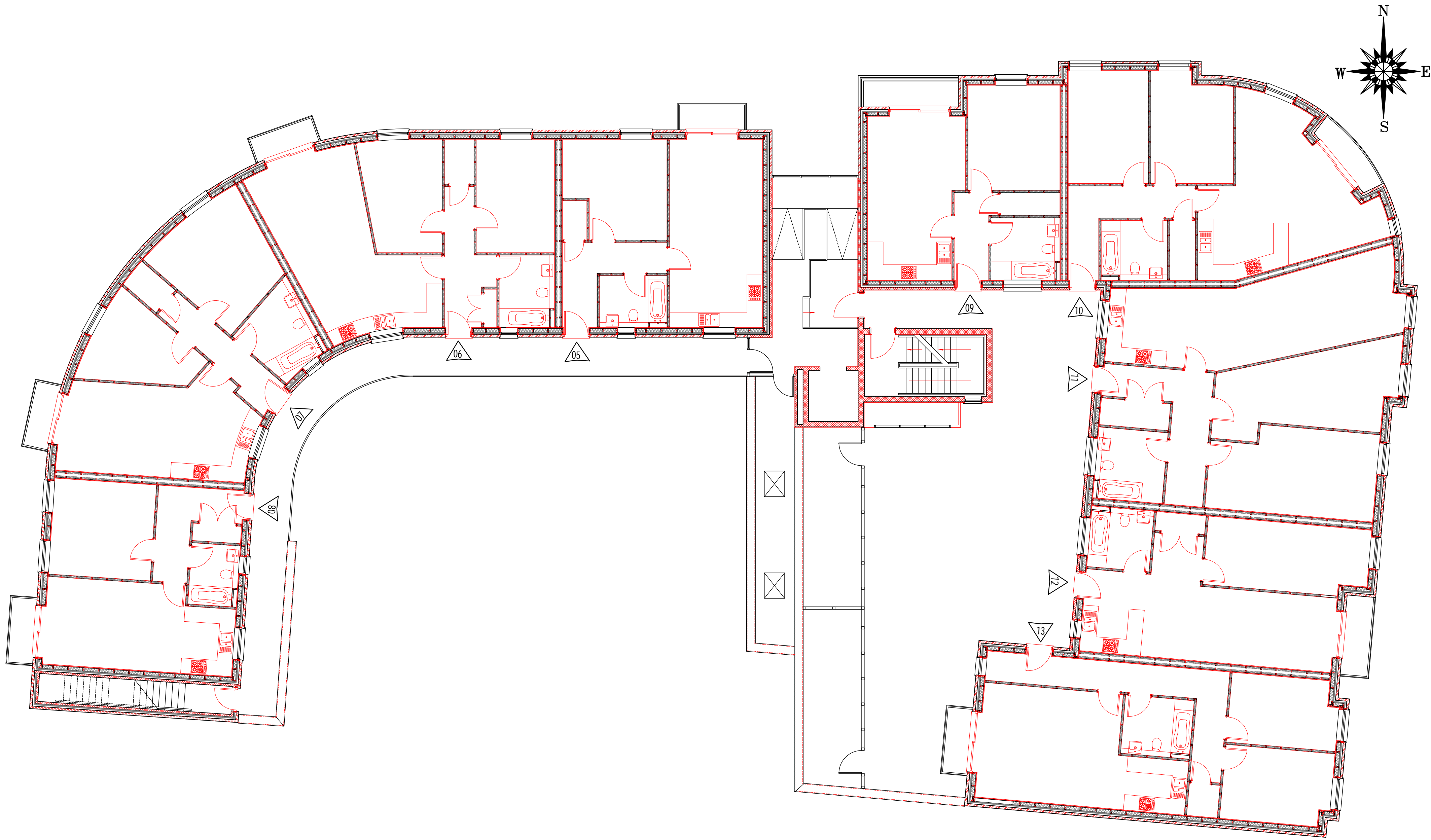
FIRST FLOOR PLAN Scale : 1:100 @A1