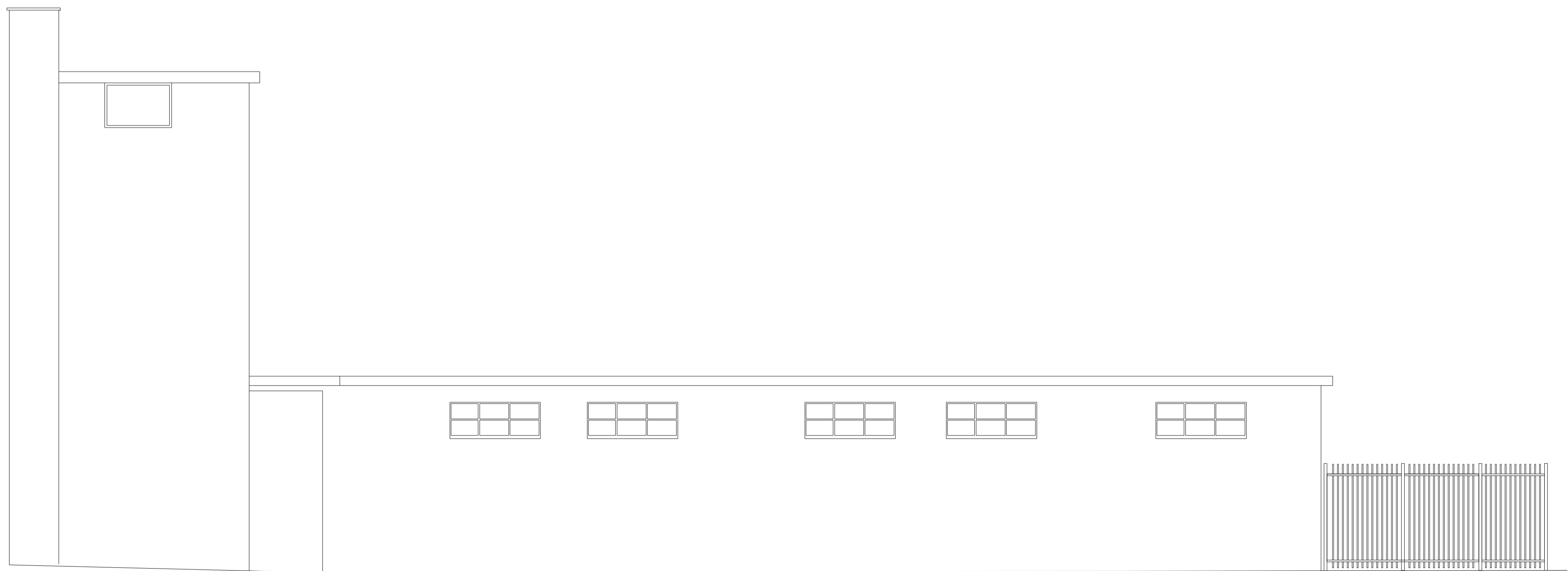
Proposed West Elevation From Road