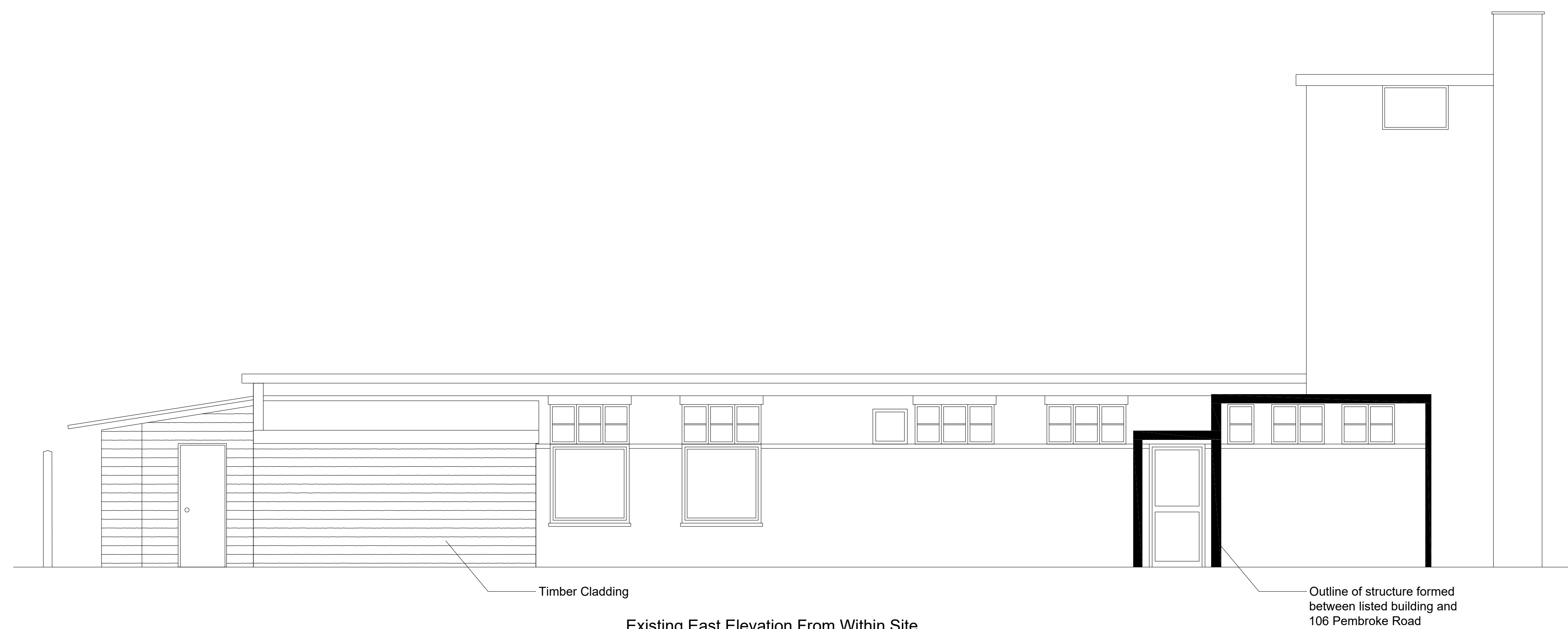
Existing East Elevation From Within Site