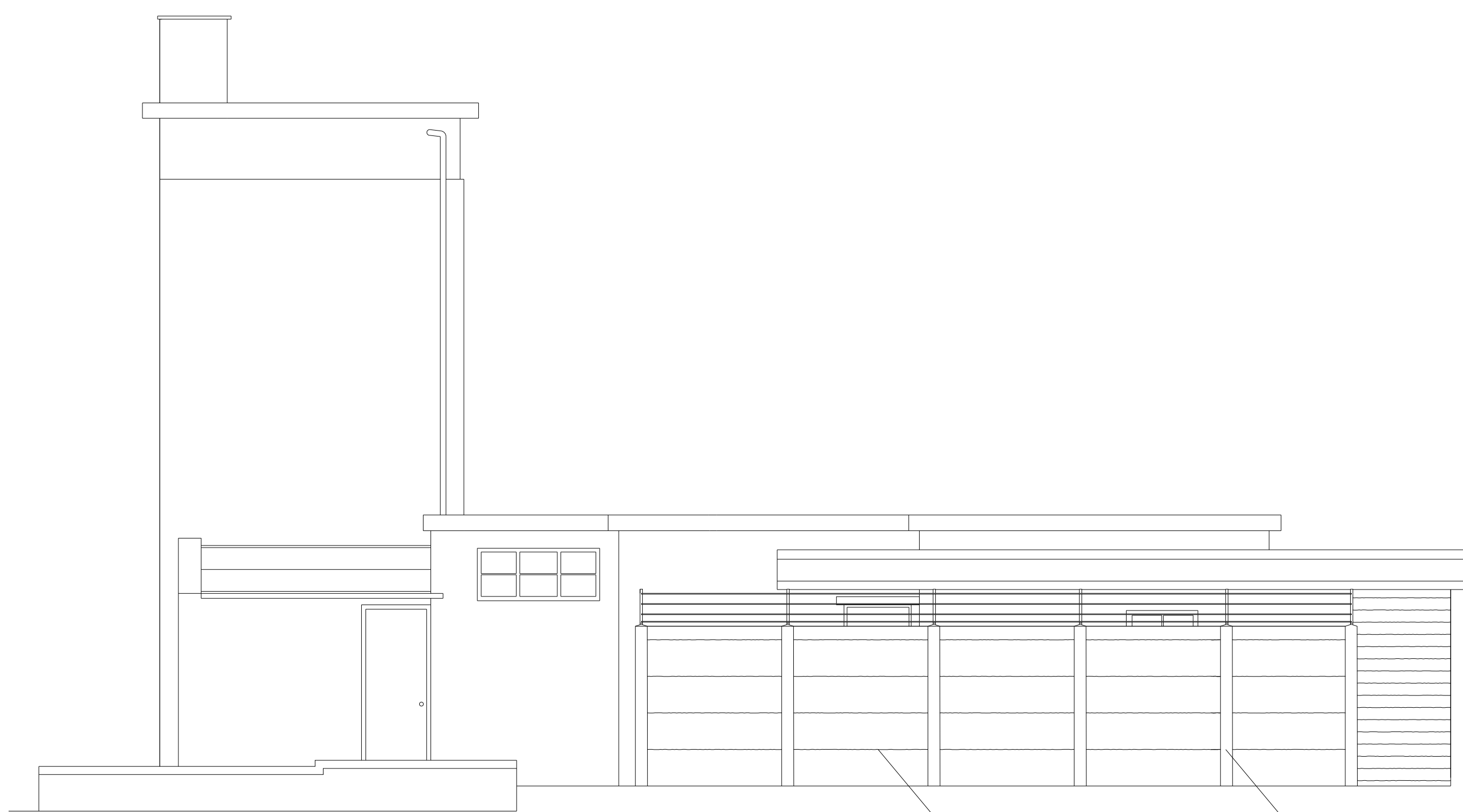
Existing South Elevation From Road