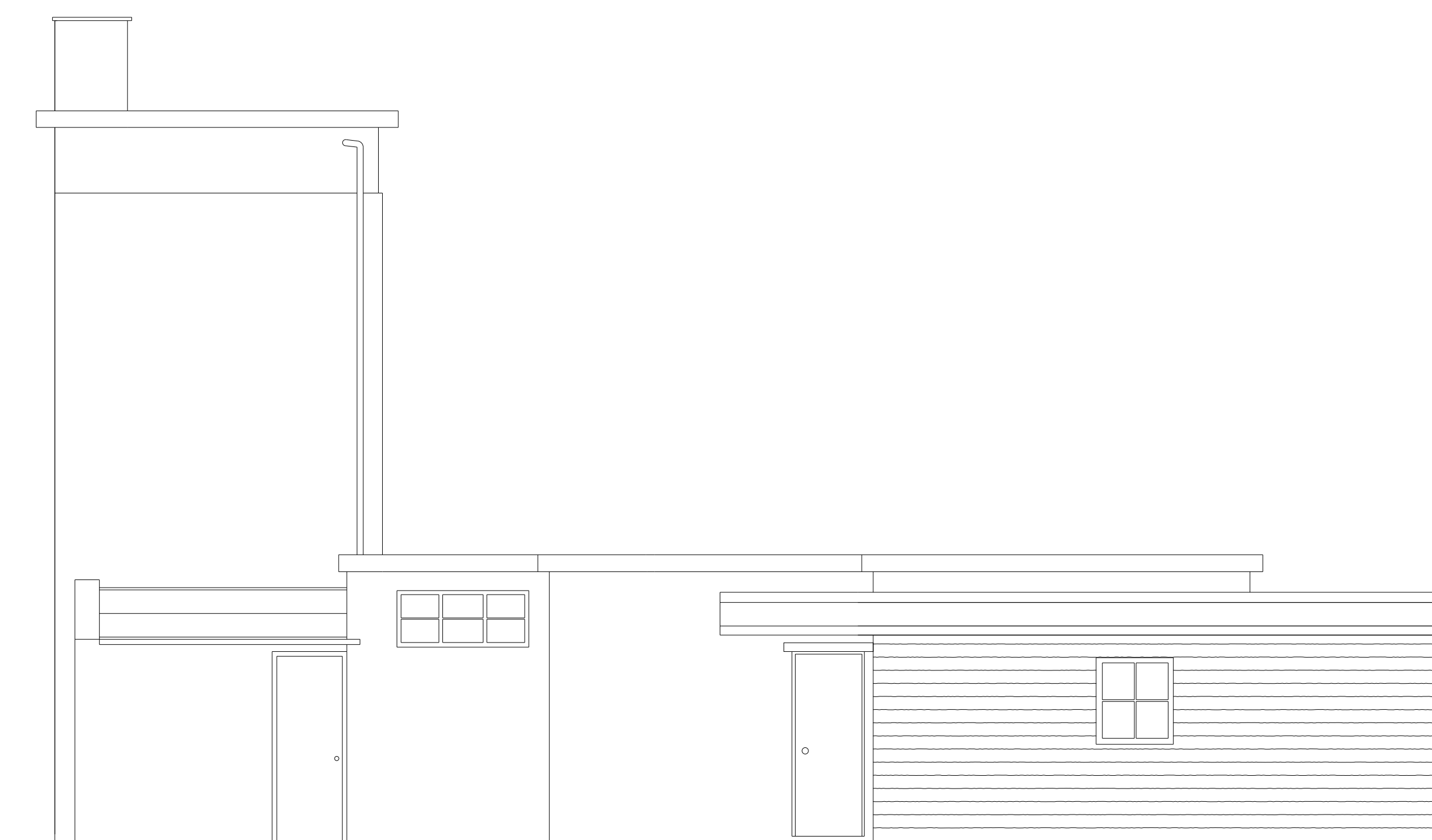
Existing South Elevation From Within Site