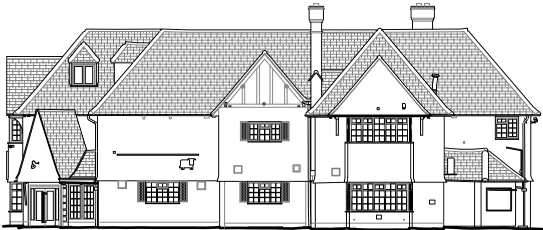
1 Existing South Elevation Scale: 1:200