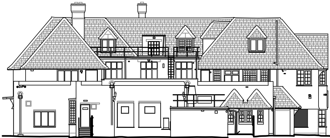
2 Existing North Elevation Scale: 1:200