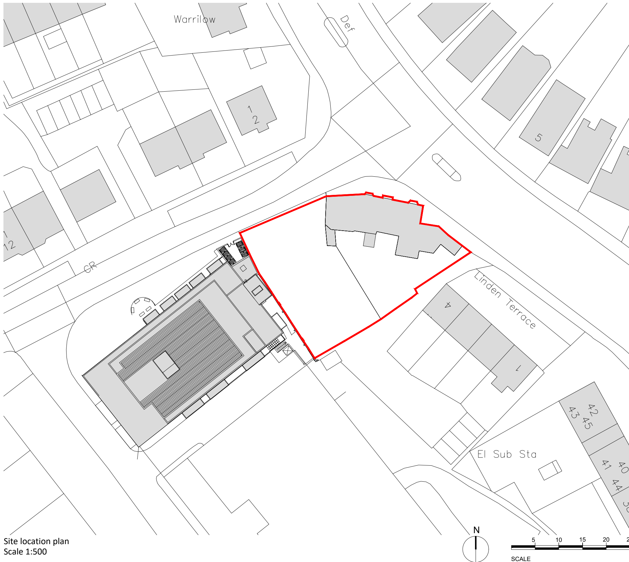
Site location plan Scale 1:500