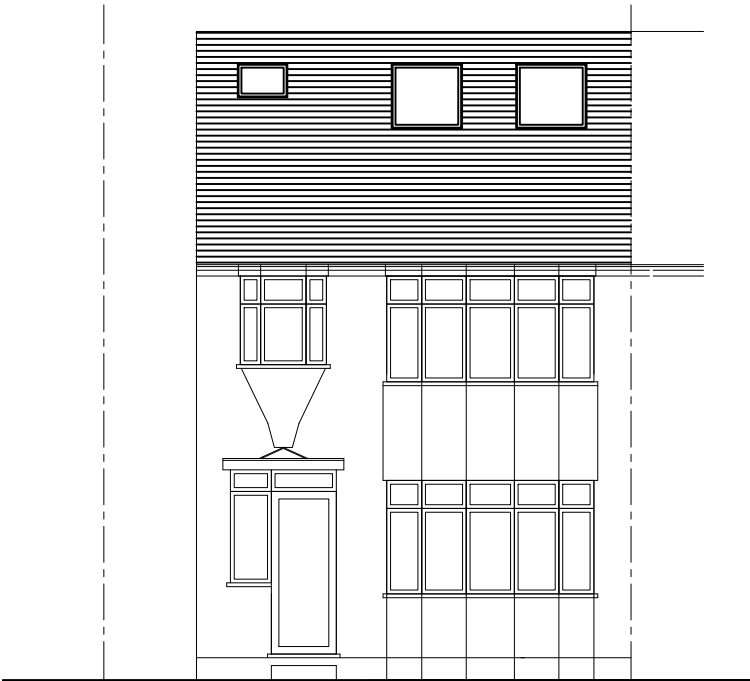
Proposed Front Elevation No Change