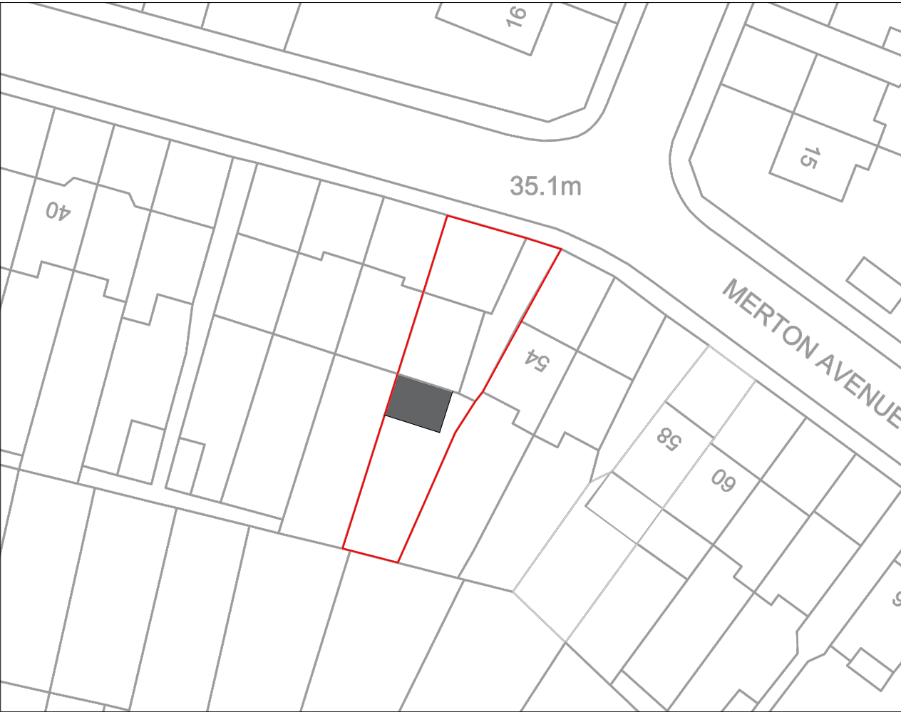
SITE PLAN Scale 1:500