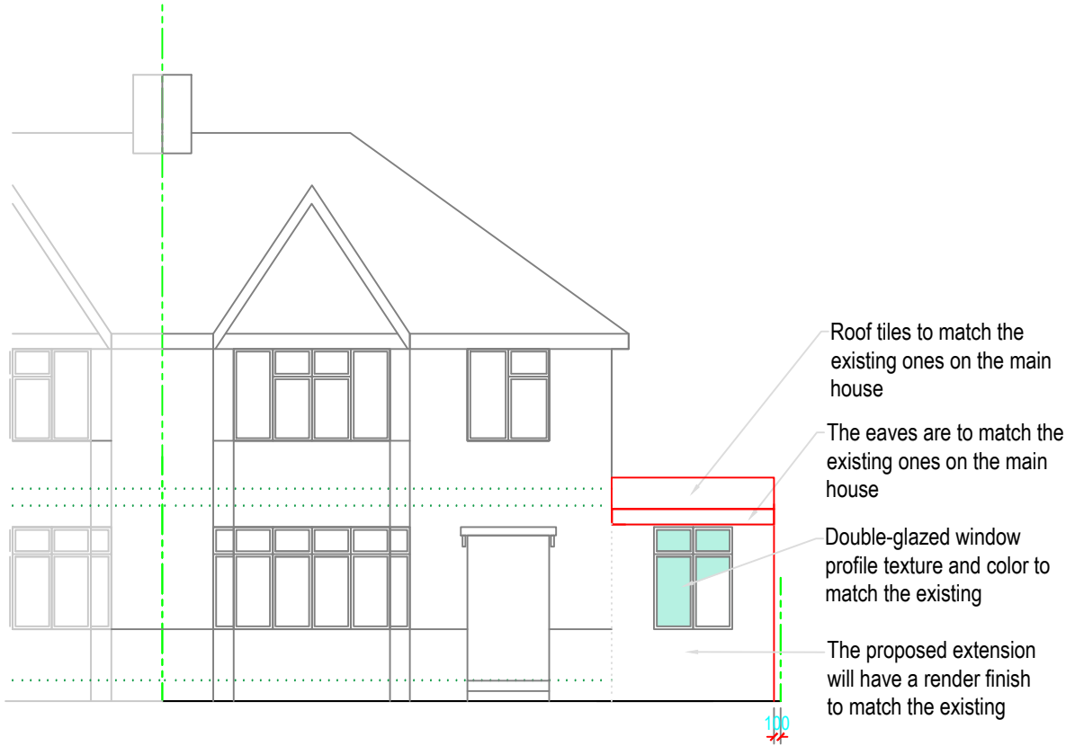
FRONT ELEVATION Scale 1:100 @ A3