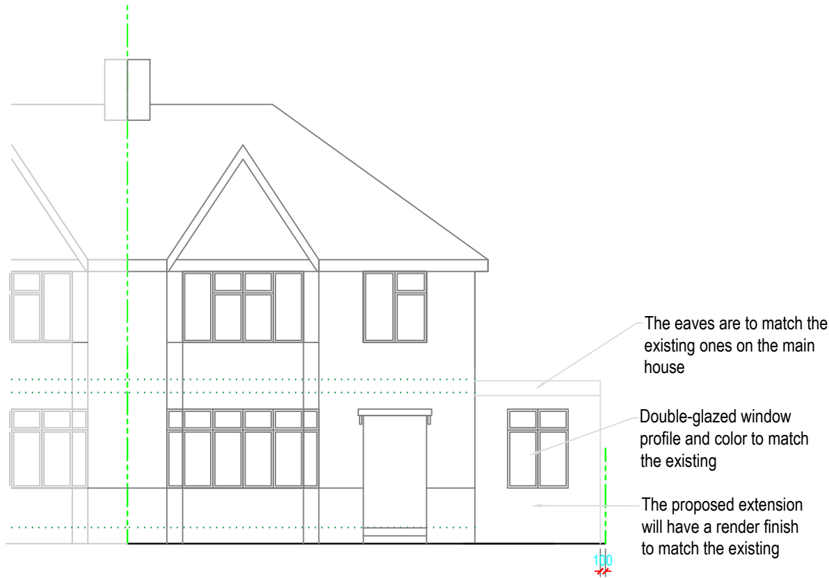
FRONT ELEVATION Scale 1:100 @ A3