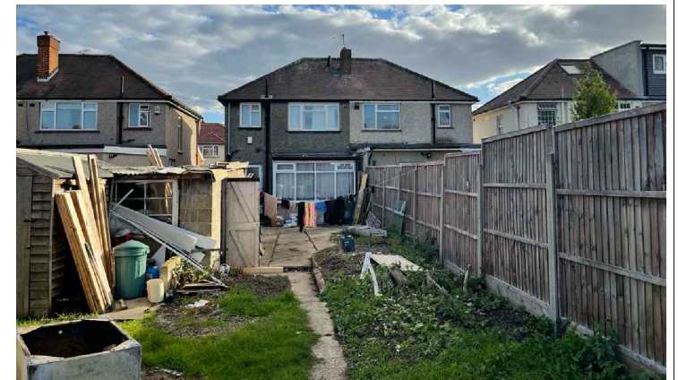
05 - REAR VIEW