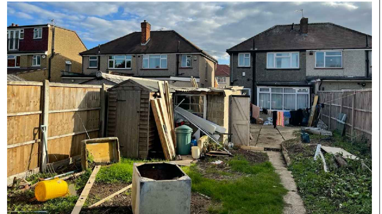
04 - REAR VIEW