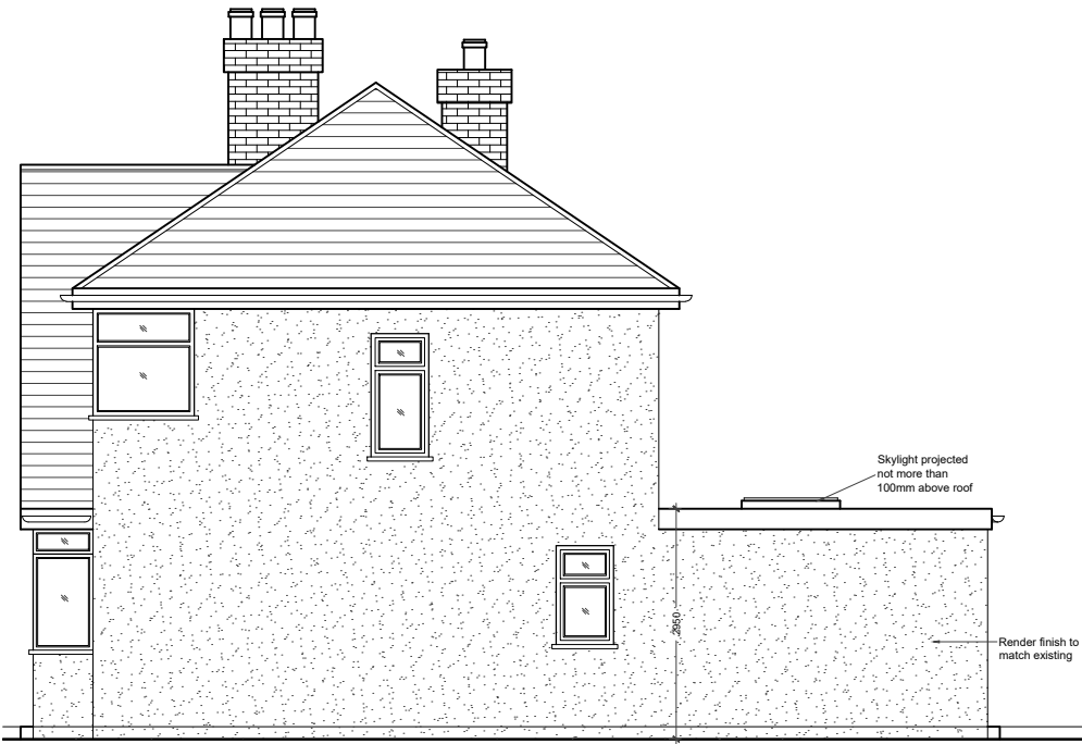
04 - SIDE ELEVATION