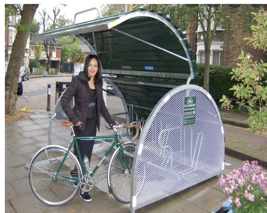
Secure Bike Hanger for 4 bikes.