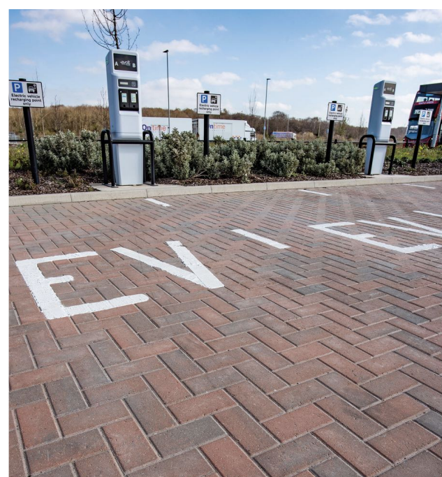
Permeable block paving to car parking and pedestrian walkways. Electrical charging points to serve 6 bays by active electrical charging points and 6 spaces served by passive charging points.