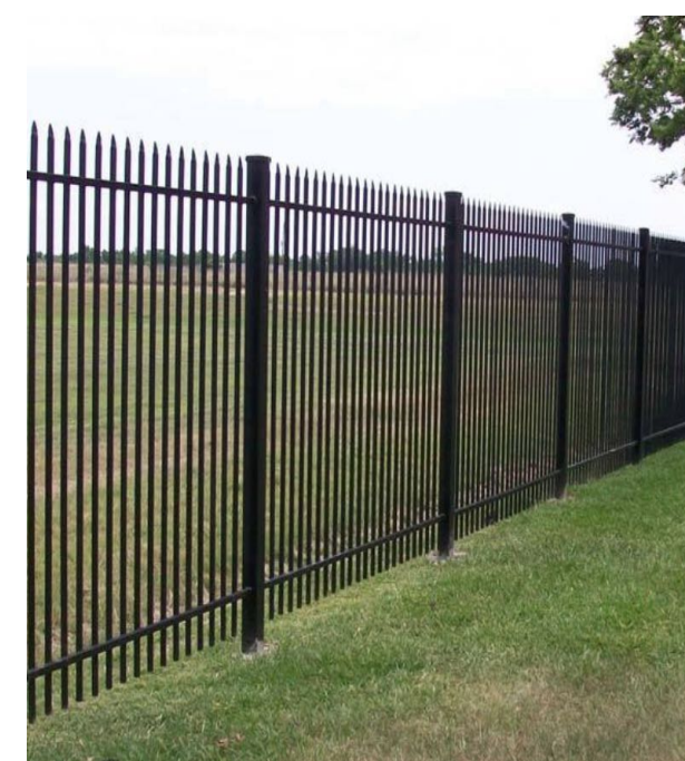
7FT Black Powder Coated Palisade for Security & Boundary Fencing