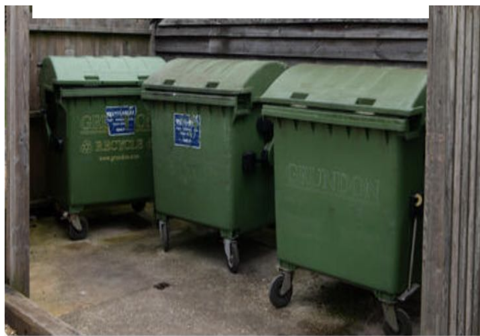
Refuse storage area of timber construction sized to LA requirements & occupants needs