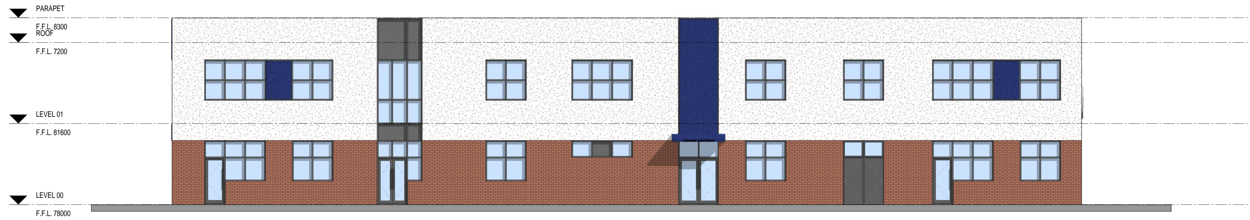
3 Proposed West Elevation 1:100