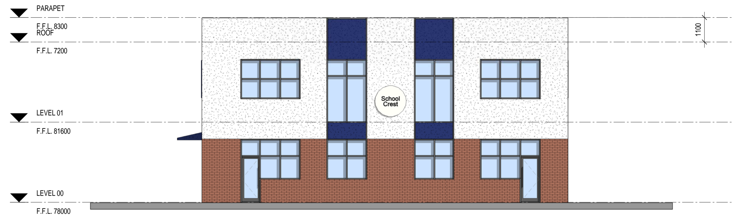
2 Proposed South Elevation 1:100