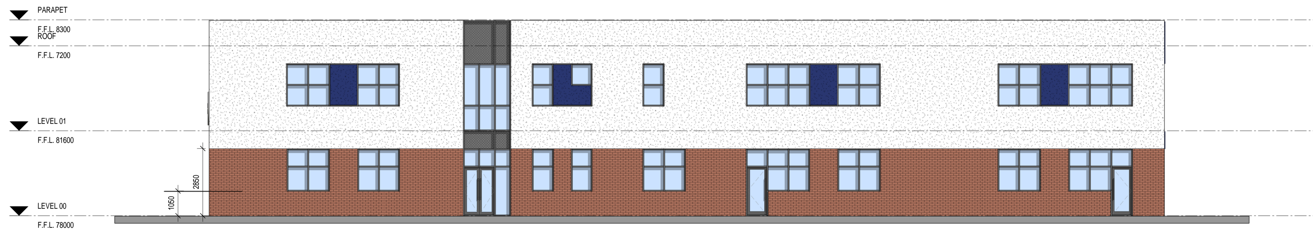
4 Proposed East Elevation 1:100

GENERAL NOTES All rights reserved. All drawings and written material appearing here, constitute original and unpublished work of the Architect and may not be duplicated, used or disclosed without written consent of the Architect. Notes and material designations are typical for similar conditions unless otherwise indicated. Do not scale from this drawing.