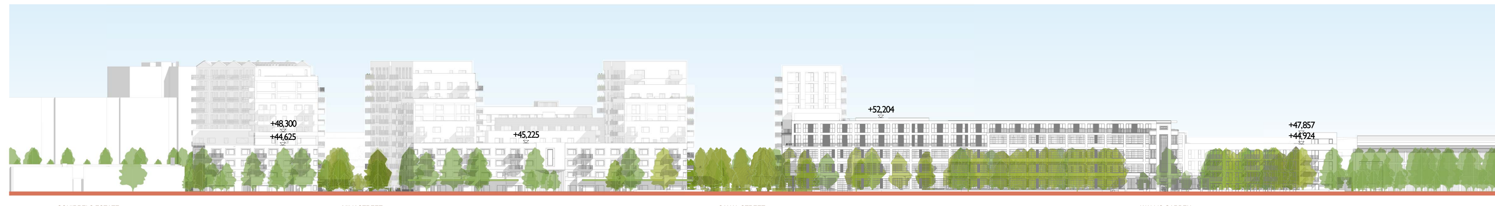
SQUIRRELS ESTATE - SOUTH ELEVATION 1:500