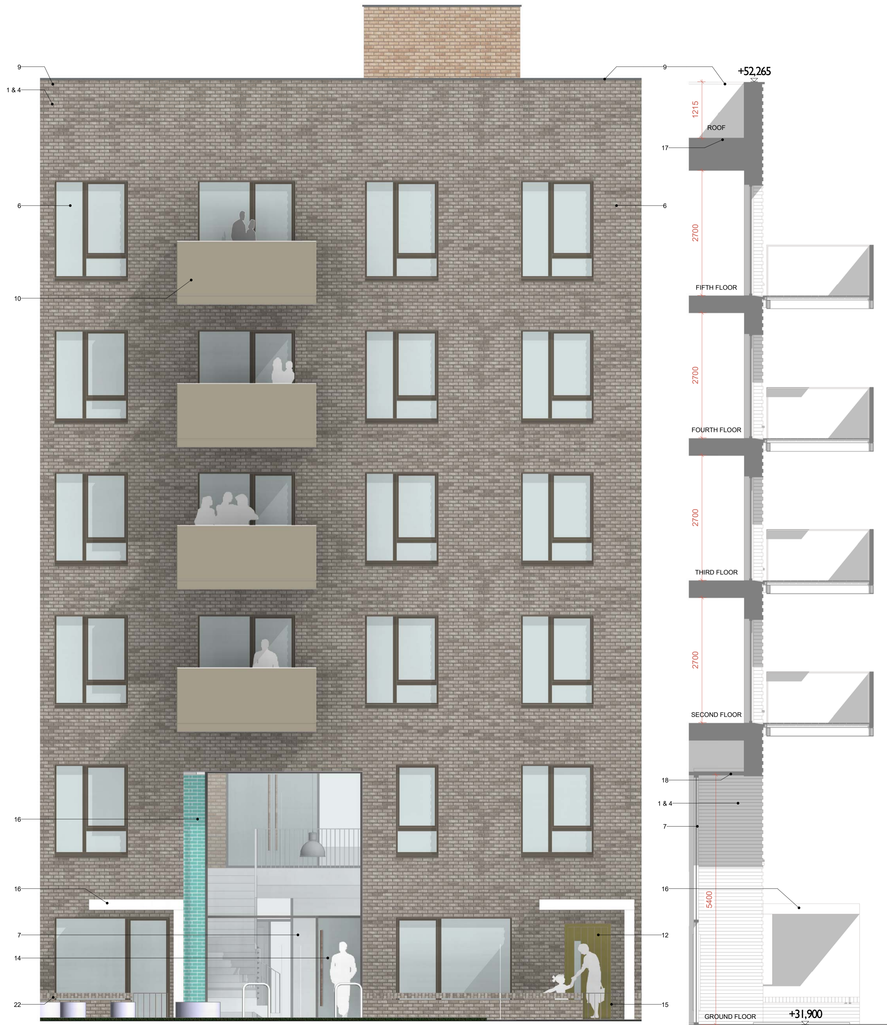
B4 - SQUARE - BAY 1:50