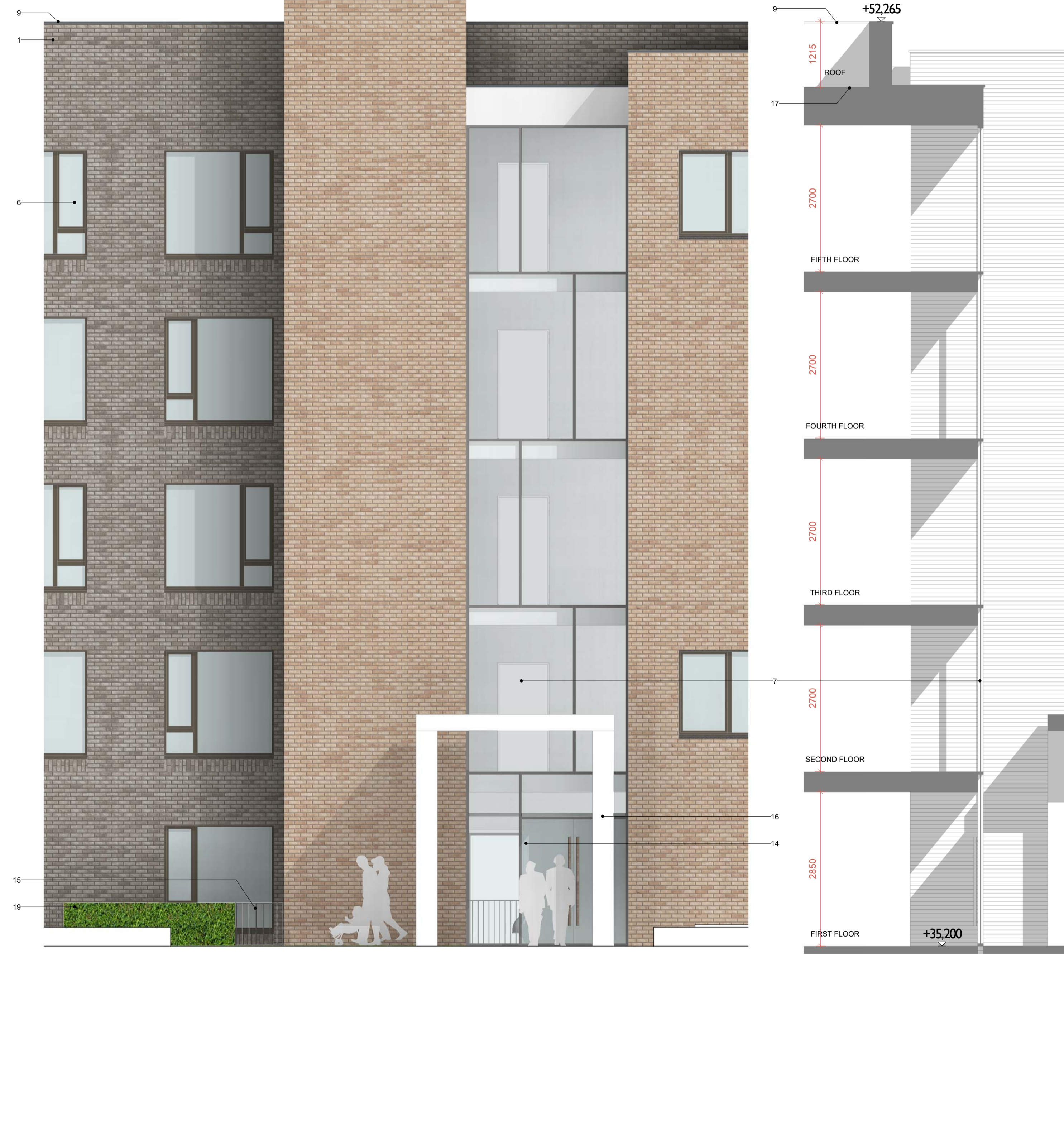
B4 - COURTYARD - BAY 1:50