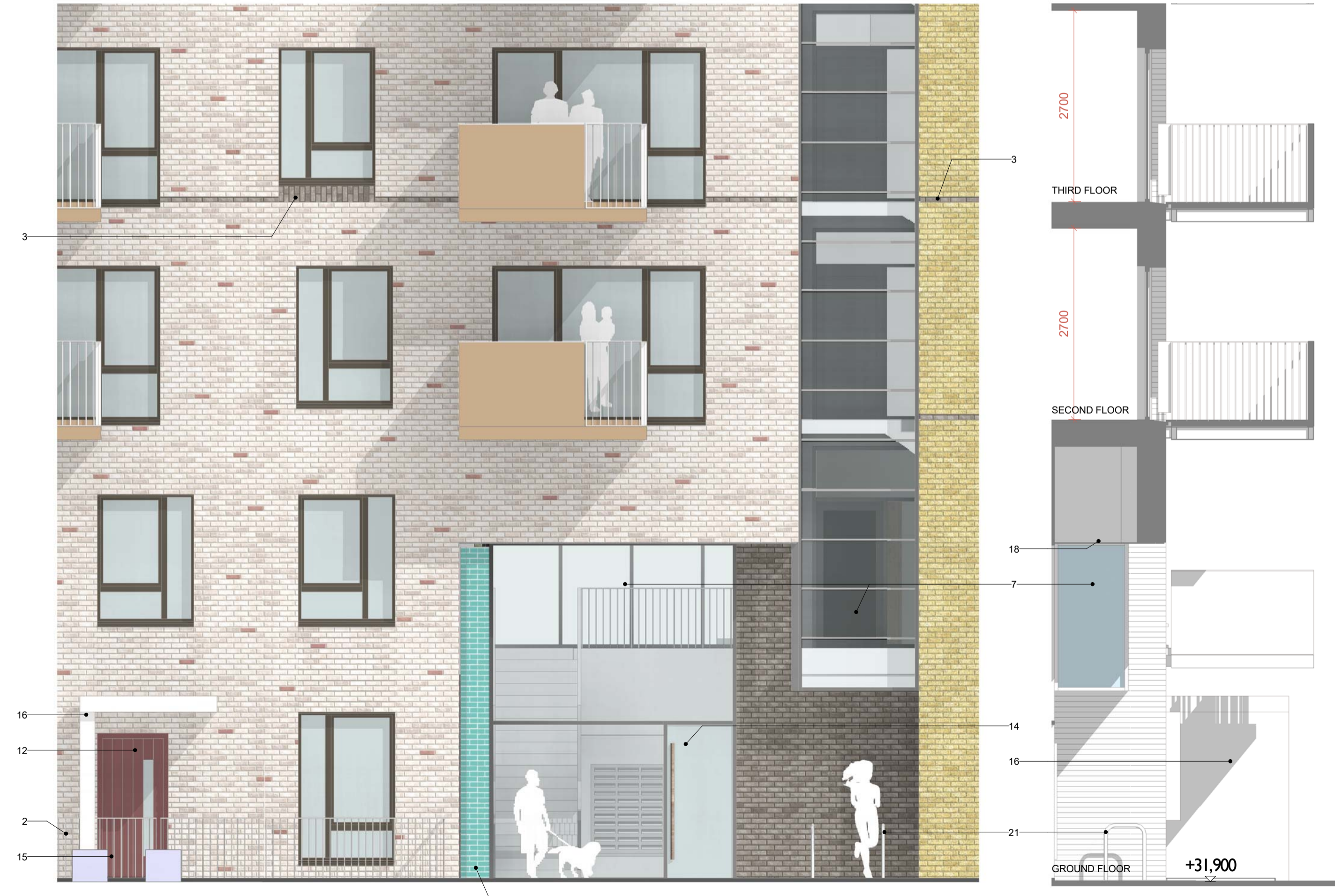
B1 - CANAL ST - BAY STUDY 1:50