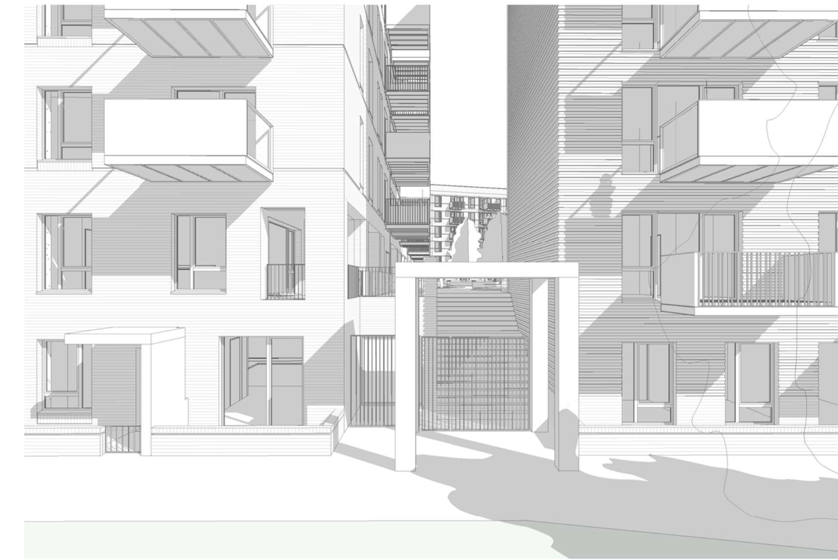
ENTRANCE PODIUM - SANDOW