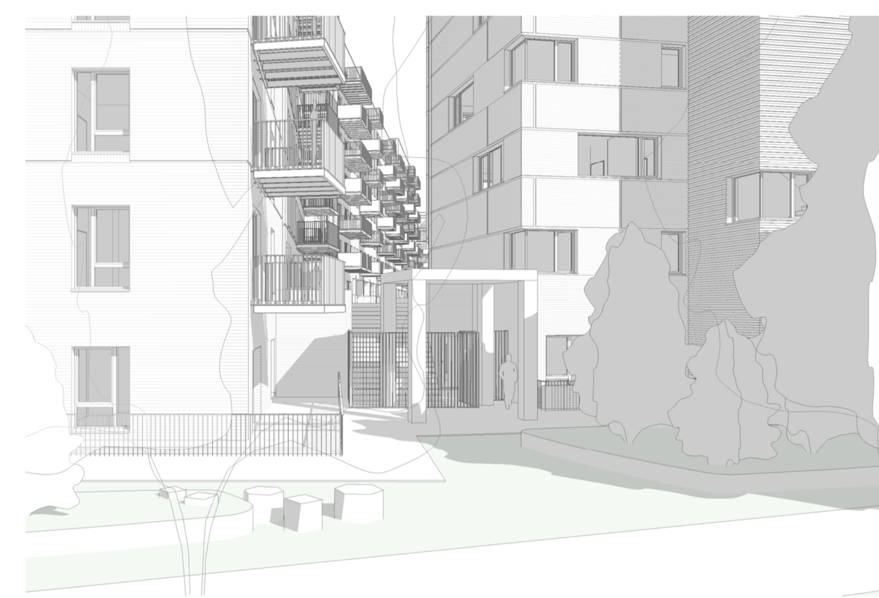
ENTRANCE PODIUM - COFFE PARK