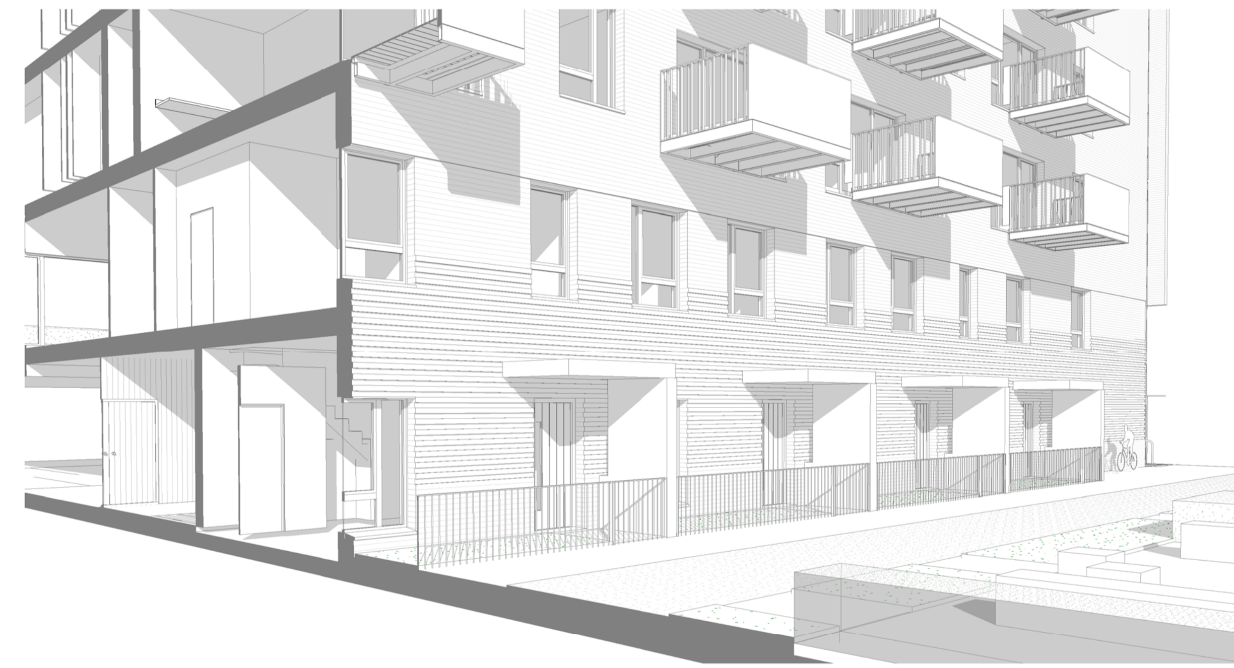
ENTRANCE DUPLEX - STREET Copy 1