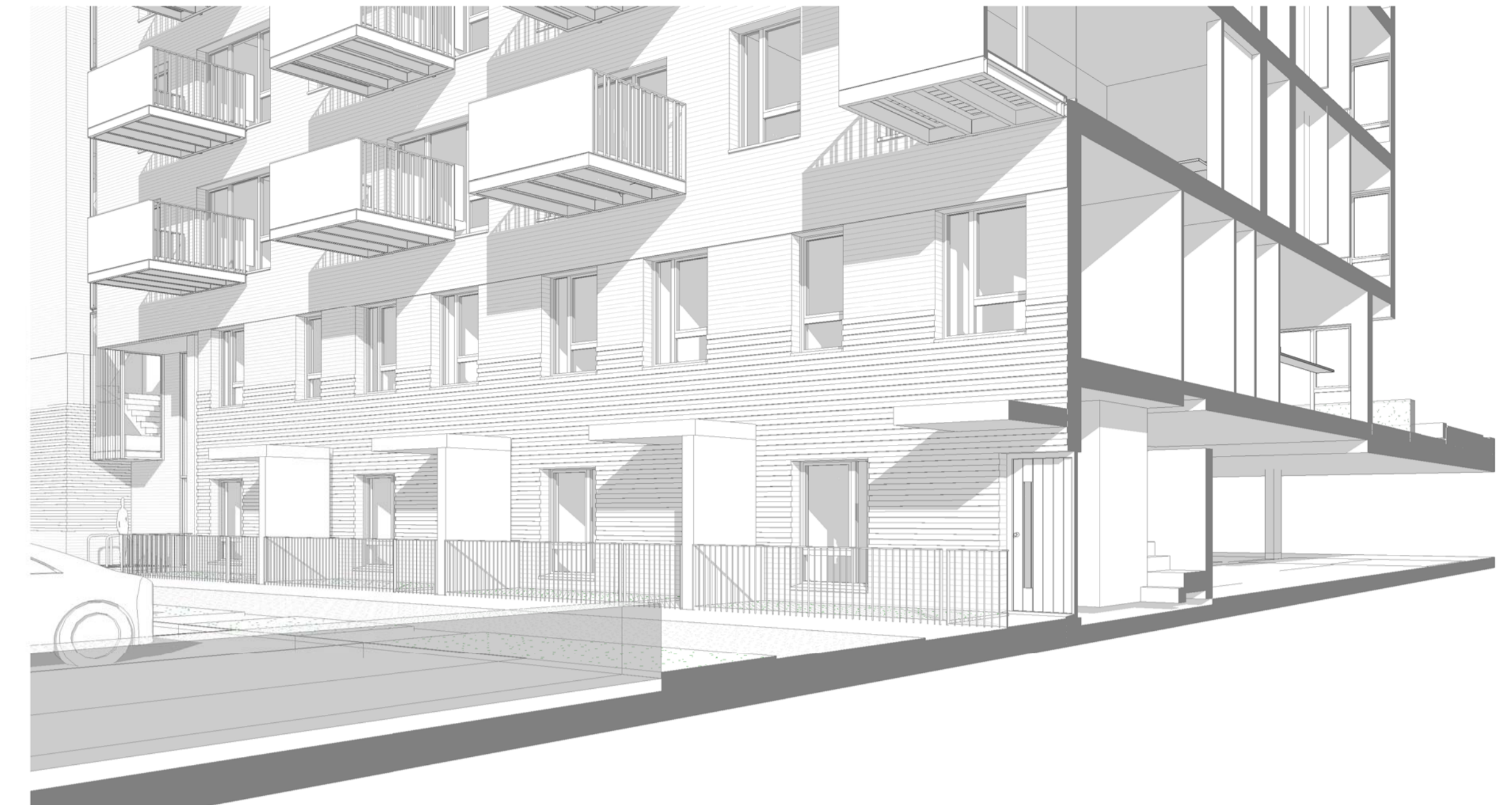
ENTRANCE DUPLEX - STREET