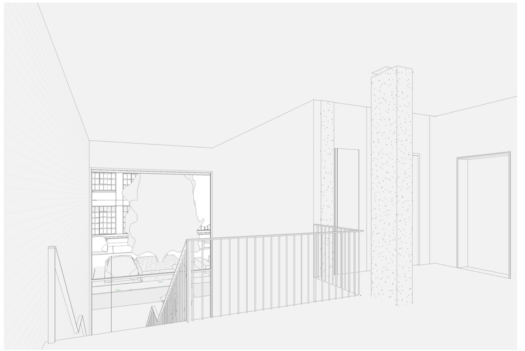
ENTRANCE LOBBY - INTERIOR