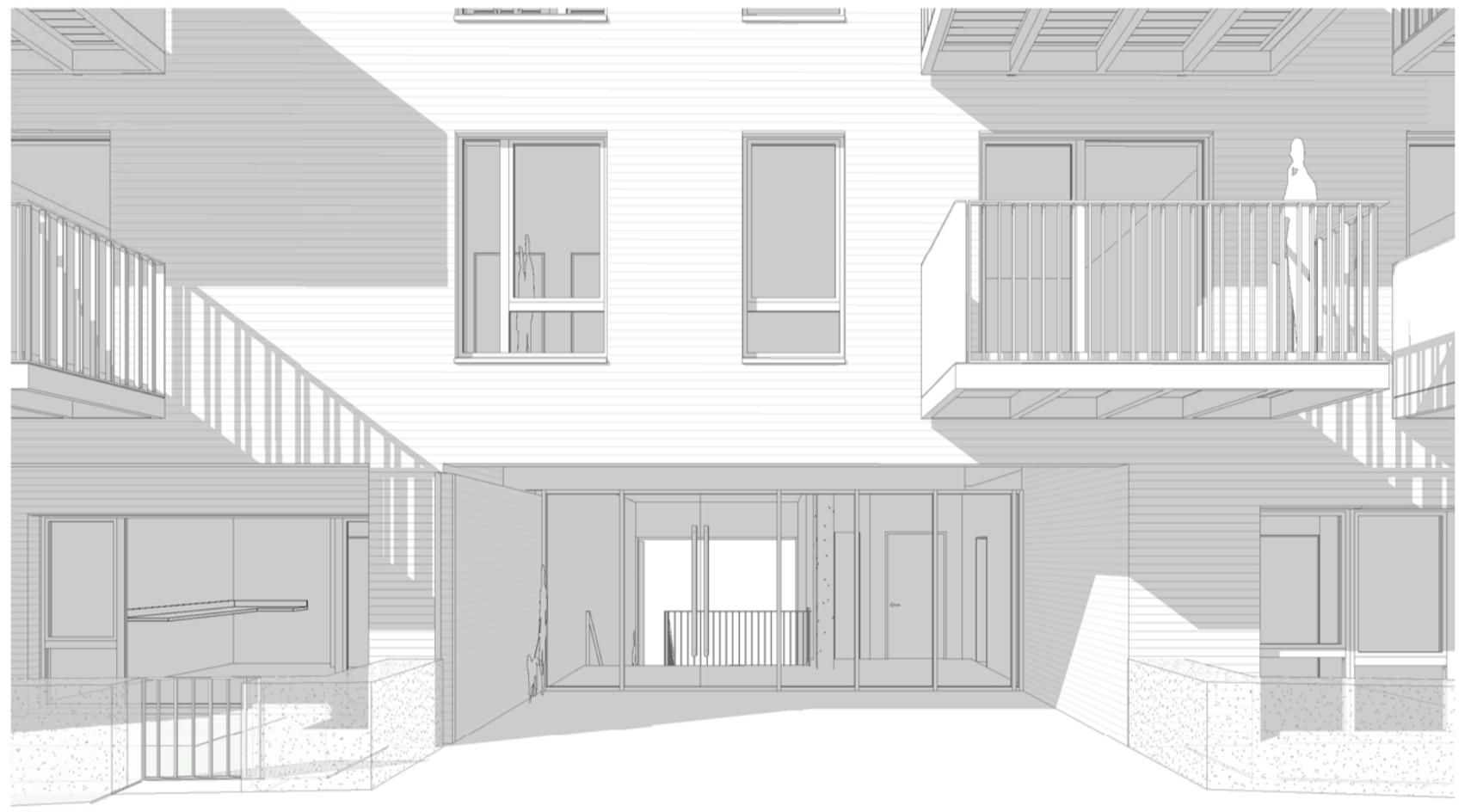
ENTRANCE LOBBY - COURTYARD