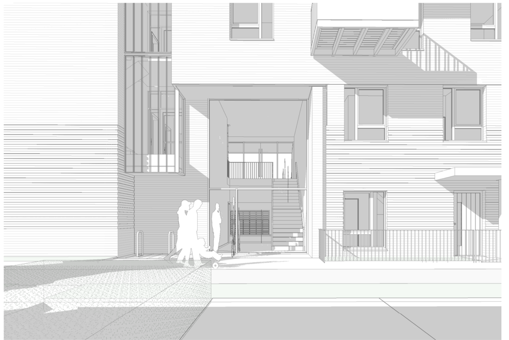
ENTRANCE LOBBY - STREET