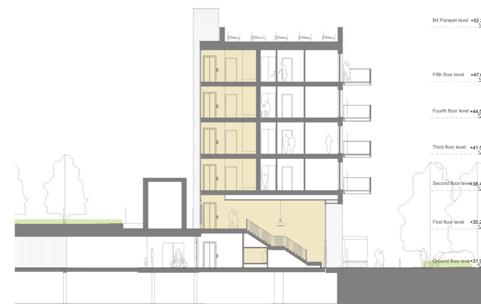
SECTION BLOCK B4 1:200