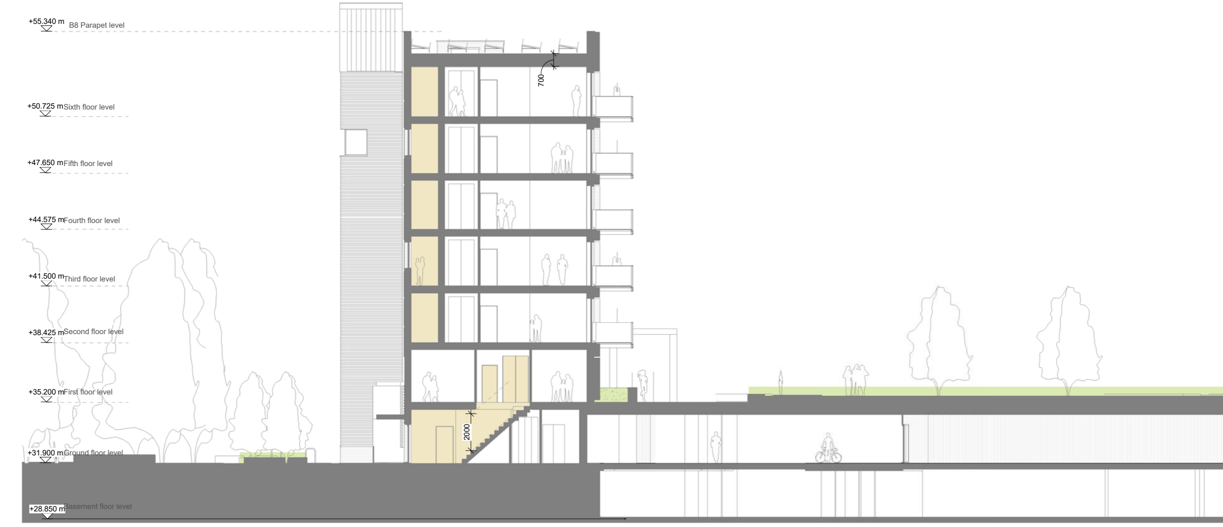
SECTION BLOCK B8 1:200