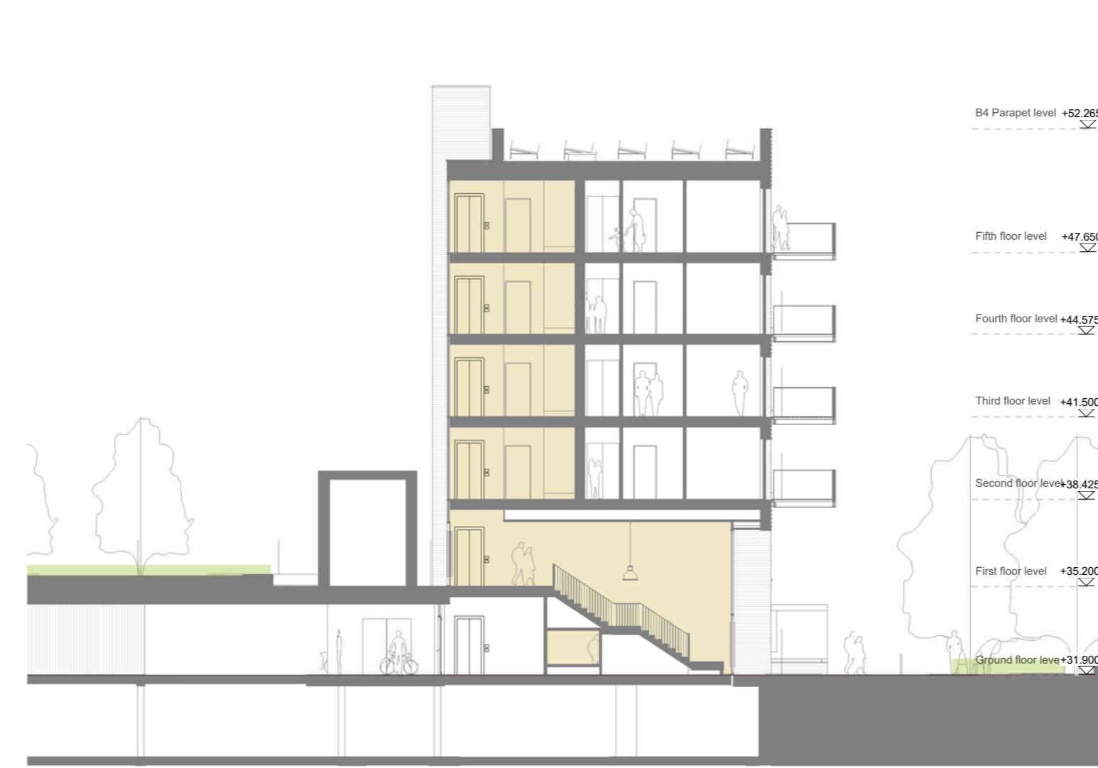
SECTION BLOCK B4 1:200