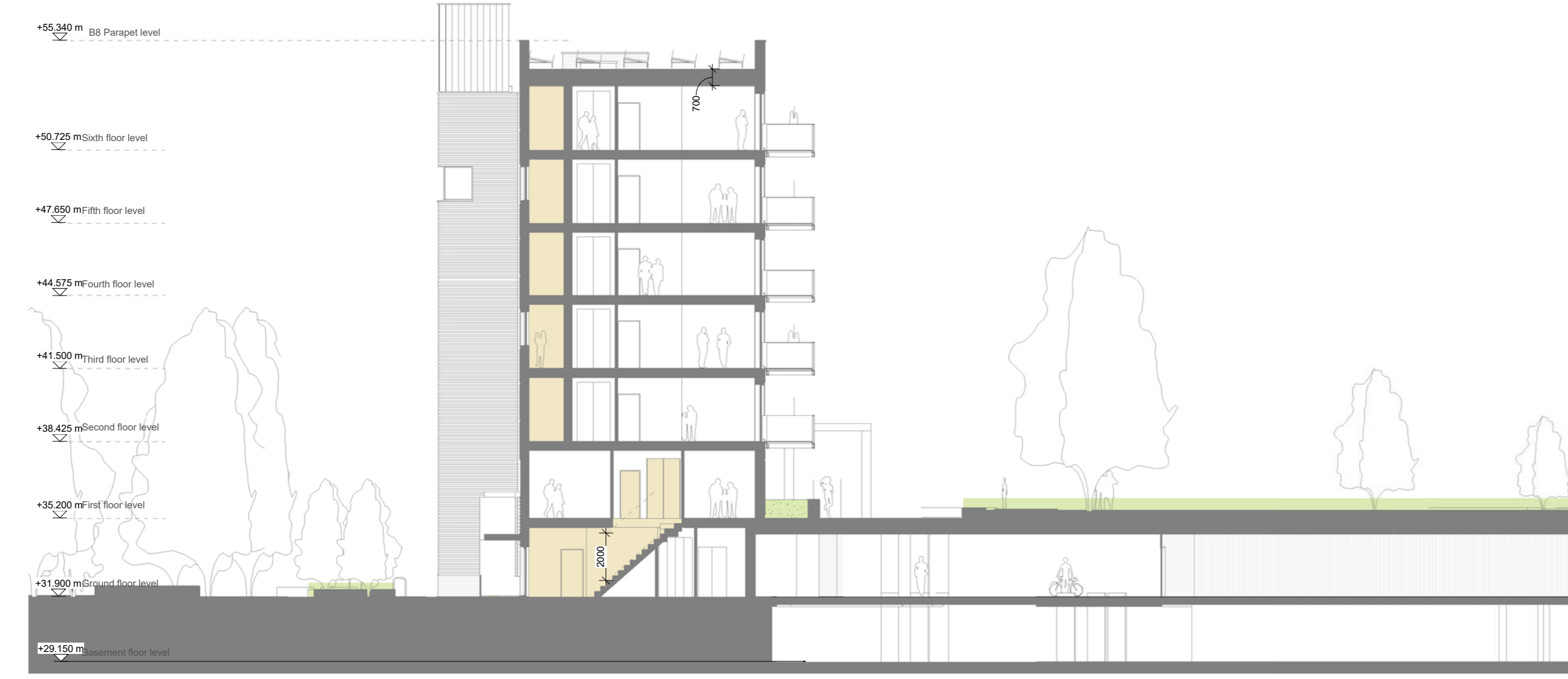
SECTION BLOCK B8 1:200