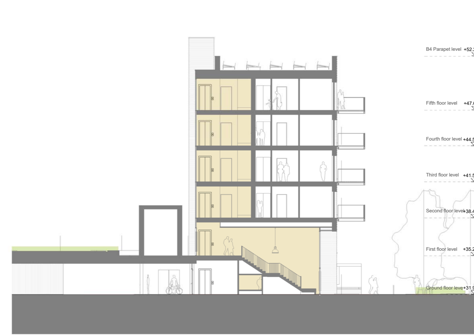
SECTION BLOCK B4 1:200