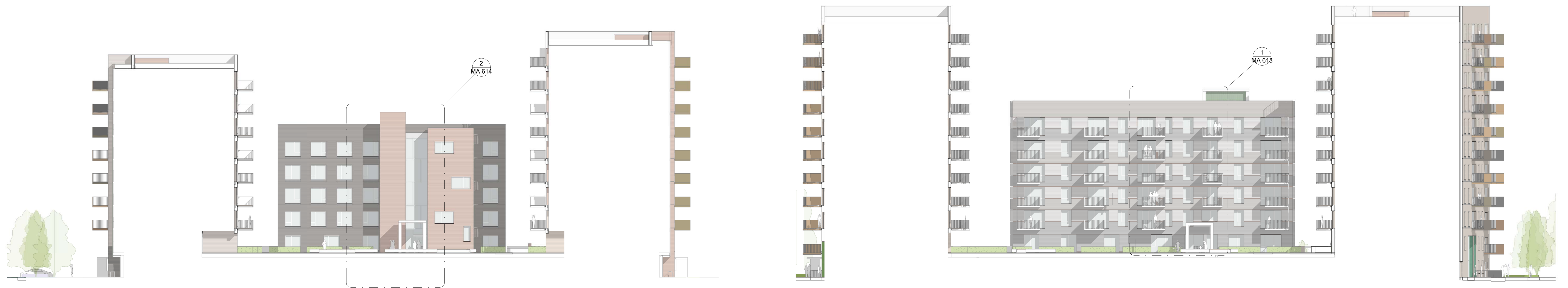
COURTYARD NORTH ELEVATION - B4 1:200