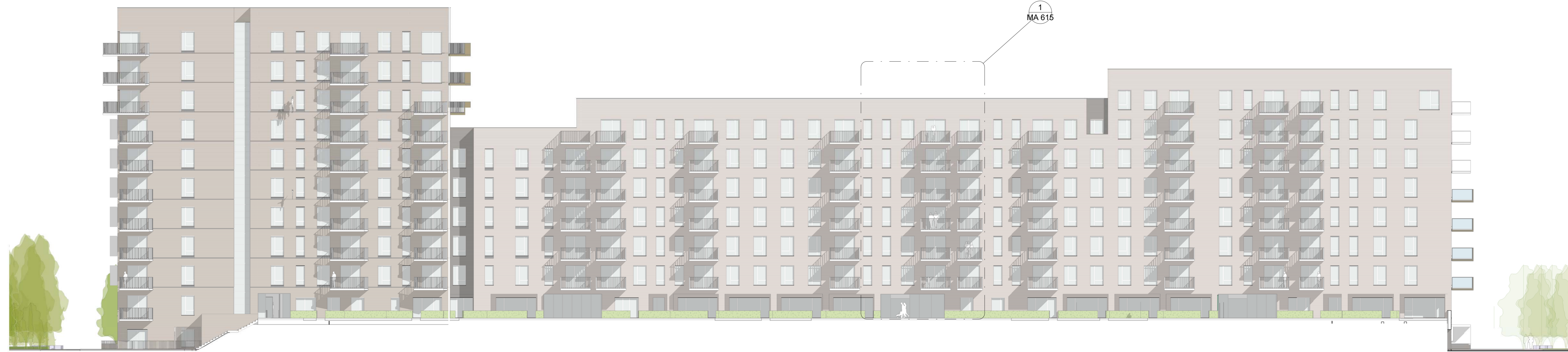
COURTYARD WEST ELEVATION - B 1:200