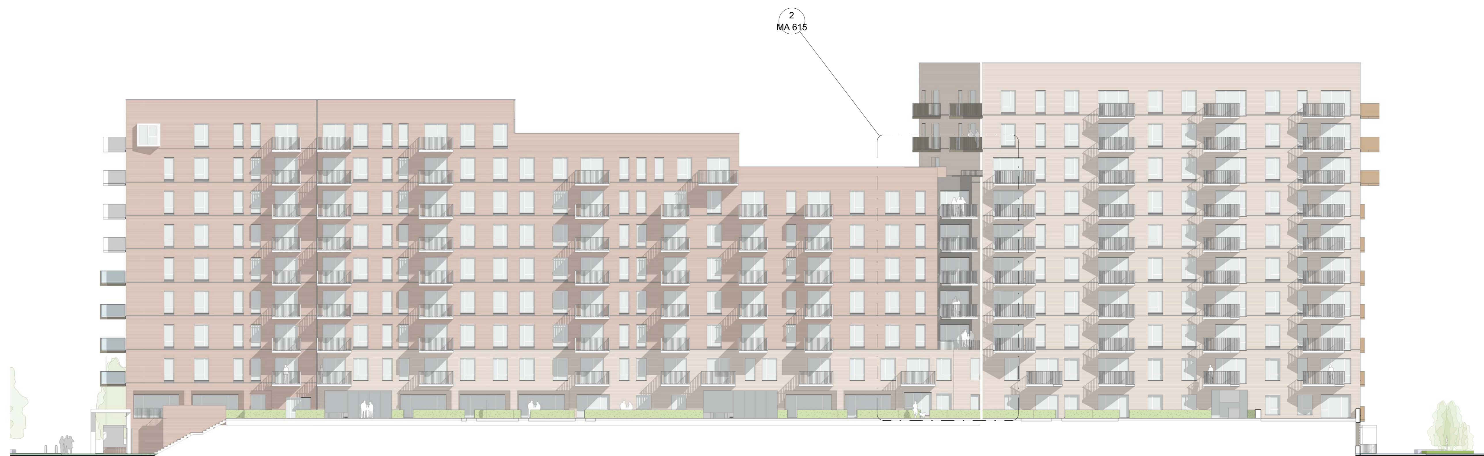
COURTYARD EAST ELEVATION - B 1:200