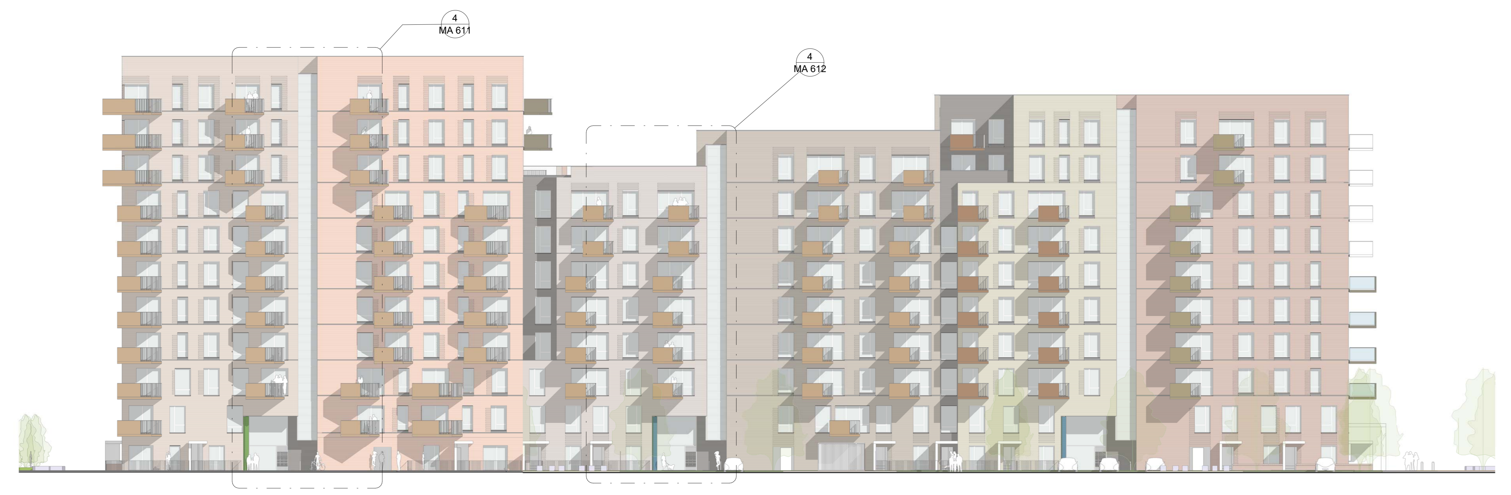
MILK STREET - WEST ELEVATION - BLOCK B 1:200