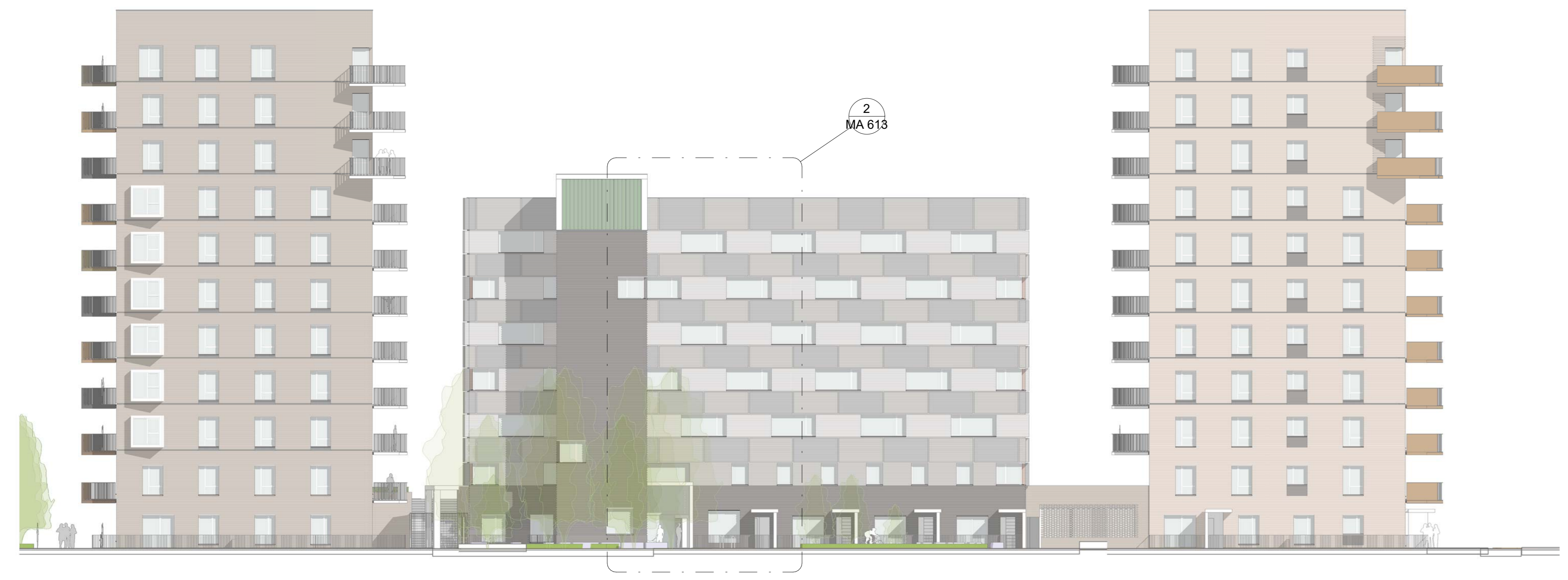
NORTH ELEVATION - B9 1:200