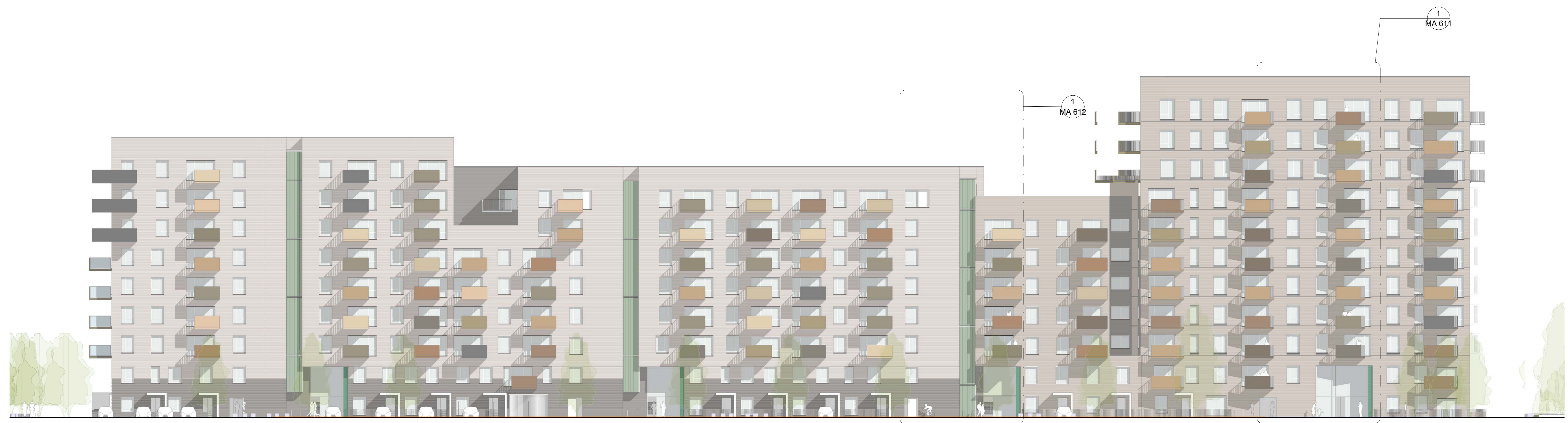
CANAL STREET ELEVATION - BLOCK B 1:200