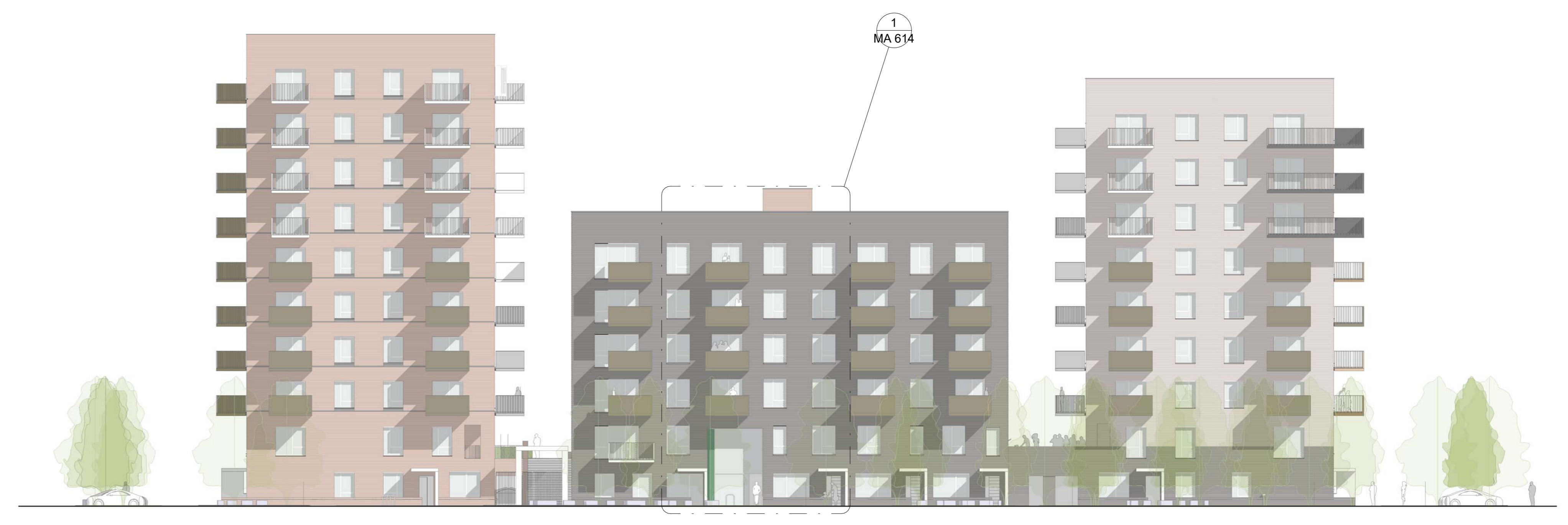
SANDOW SQUARE - SOUTH ELEVATION - B 1:200